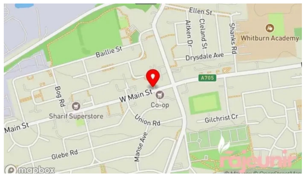
Semichem whitburn map