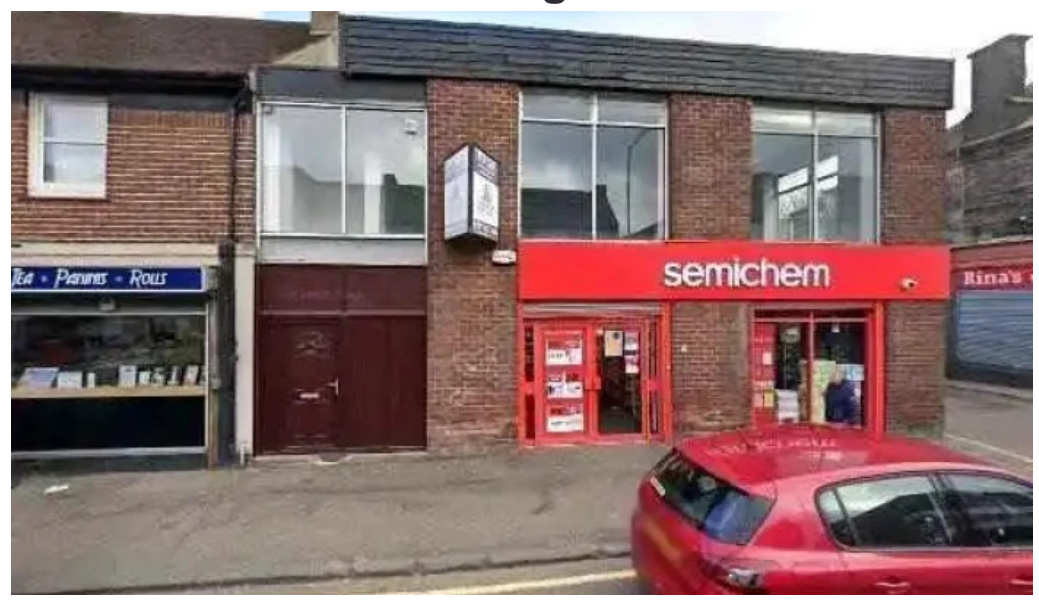
Semichem whitburn street view 360deg