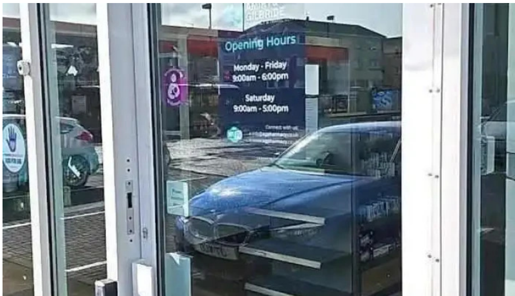
Amiry and gilbride pharmacy and travel clinic airdrie