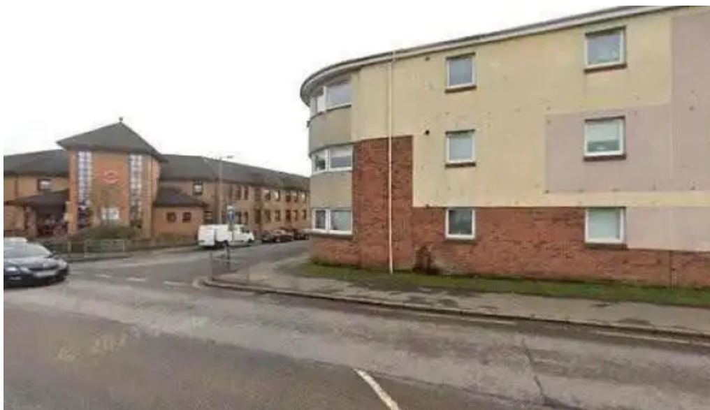
Amiry and gilbride pharmacy and travel clinic street view 360deg