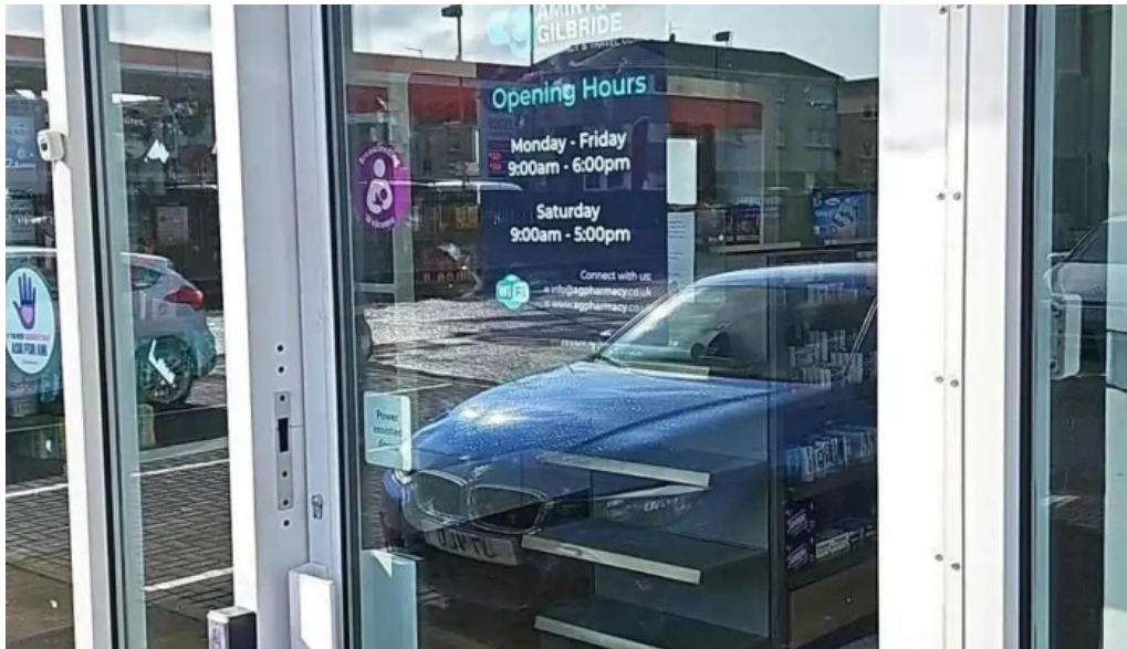
Amiry and gilbride pharmacy and travel clinic all