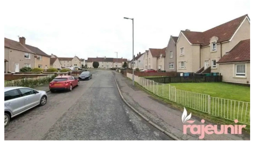
Craigneuk petersburn pharmacy airdrie