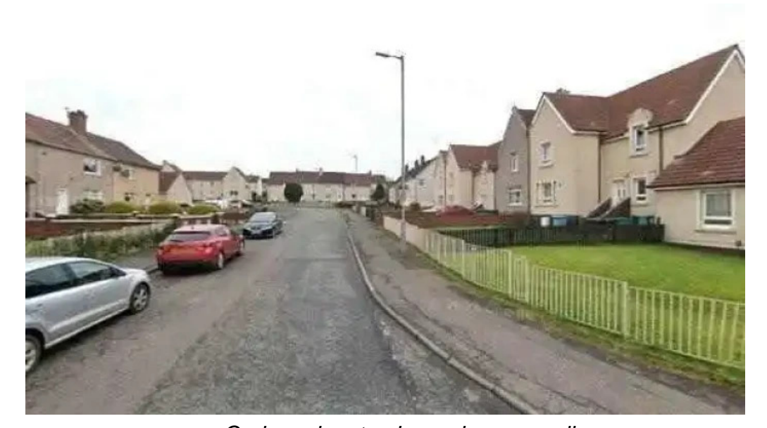
Craigneuk petersburn pharmacy all