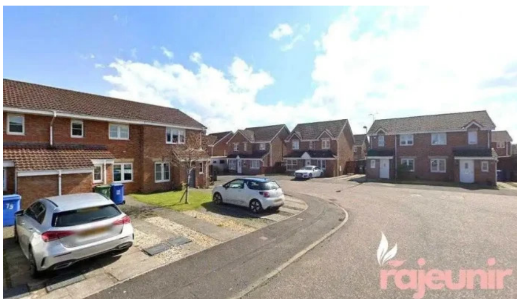
Sas healthcare bathgate