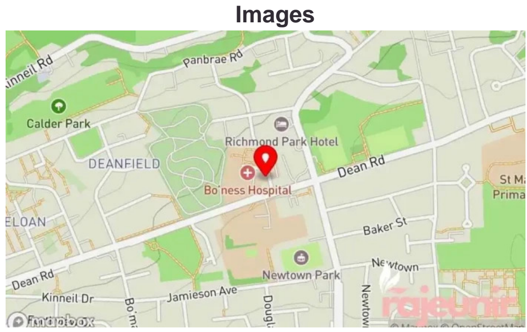
Rowlands pharmacy boness health centre map

If you require to adjust any data that you think is not accurate about this site, we urge you to forward a message so we can we will adjust it quickly. With anticipation we appreciate it.