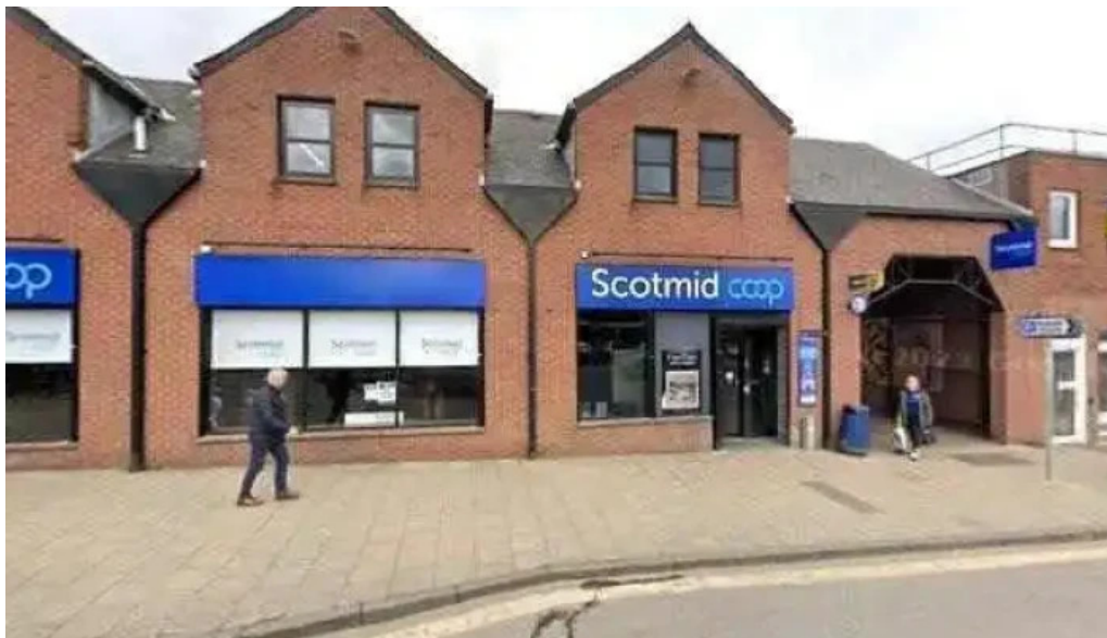
Boots pharmacy street view 360deg