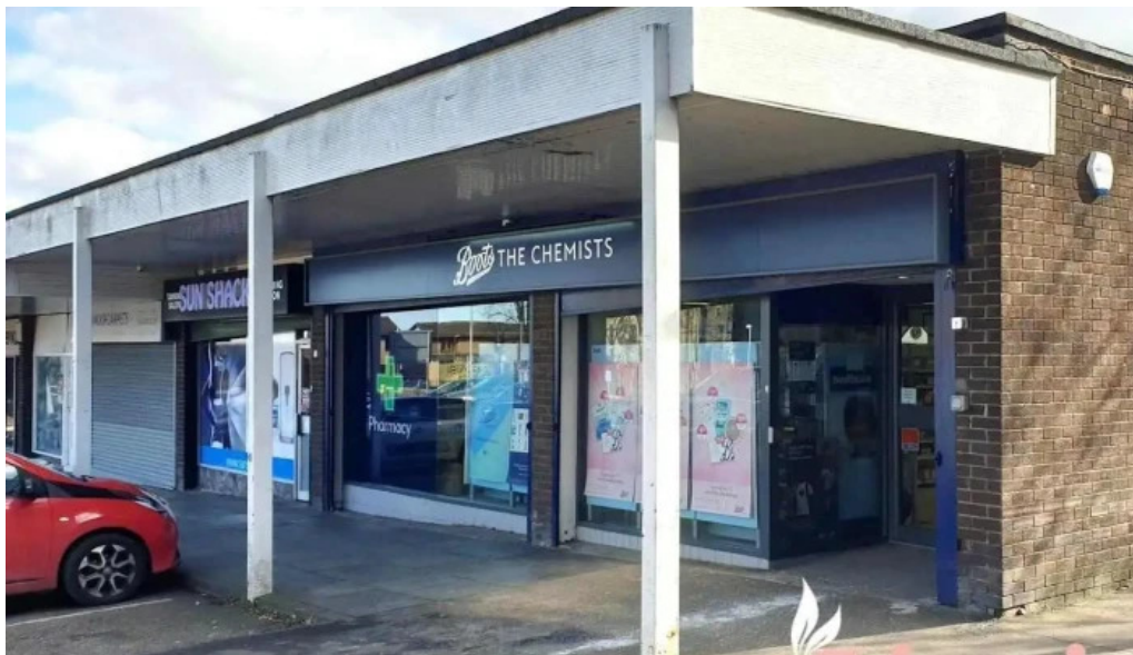
Boots pharmacy broxburn