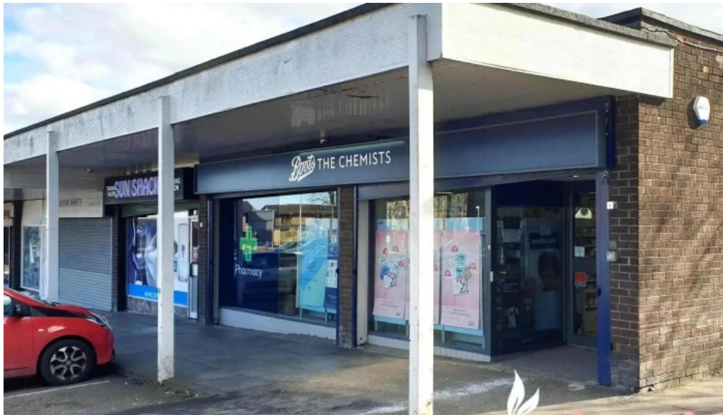
Boots pharmacy all