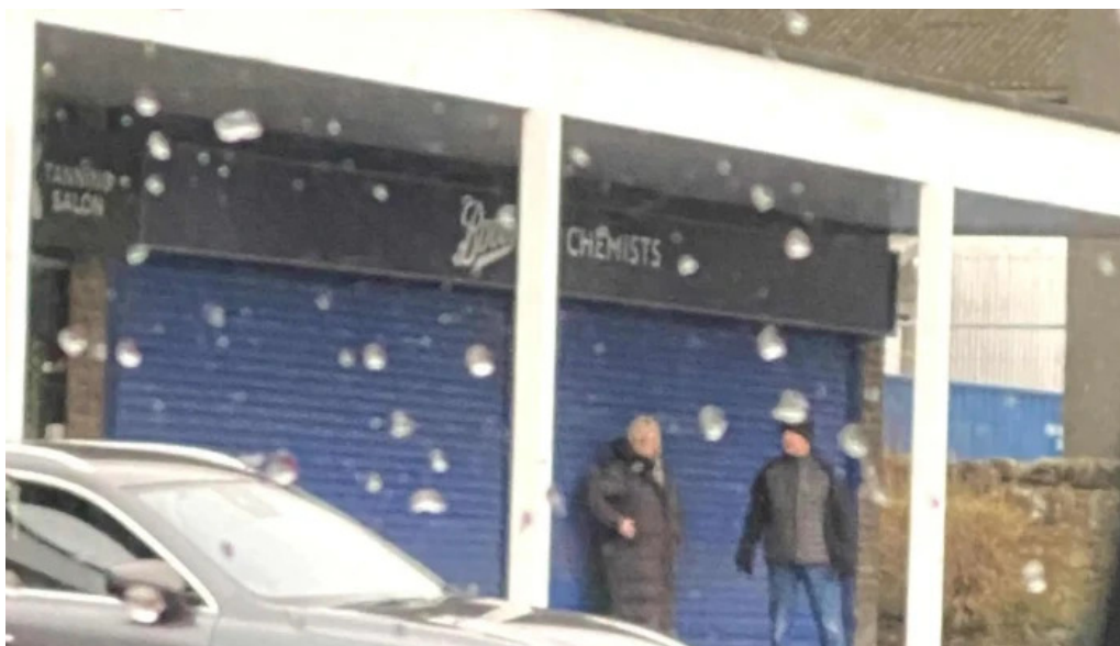
Boots pharmacy pharmacy