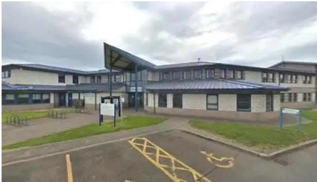
Rowlands pharmacy broxburn street view 360deg