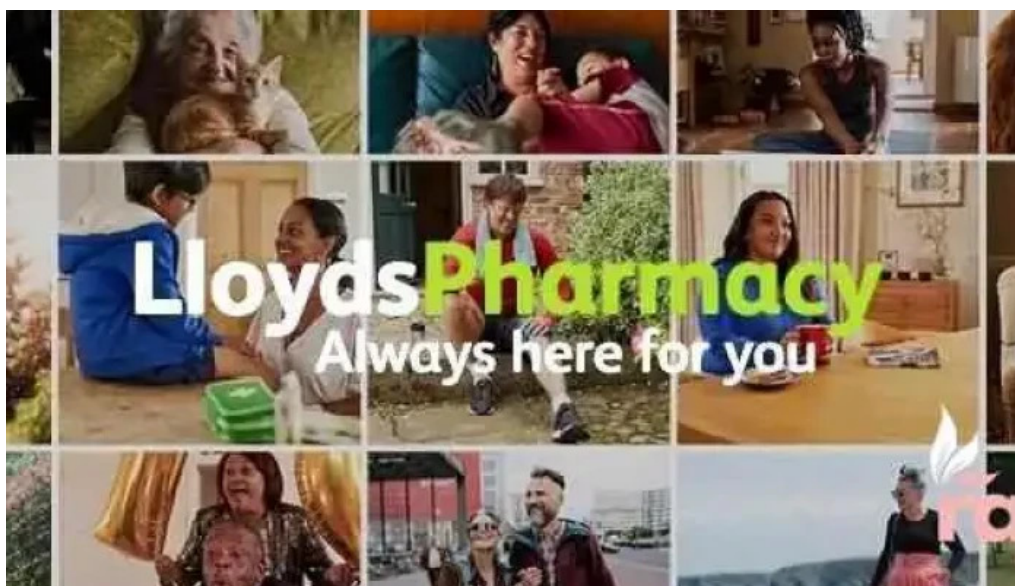
Rowlands pharmacy broxburn all