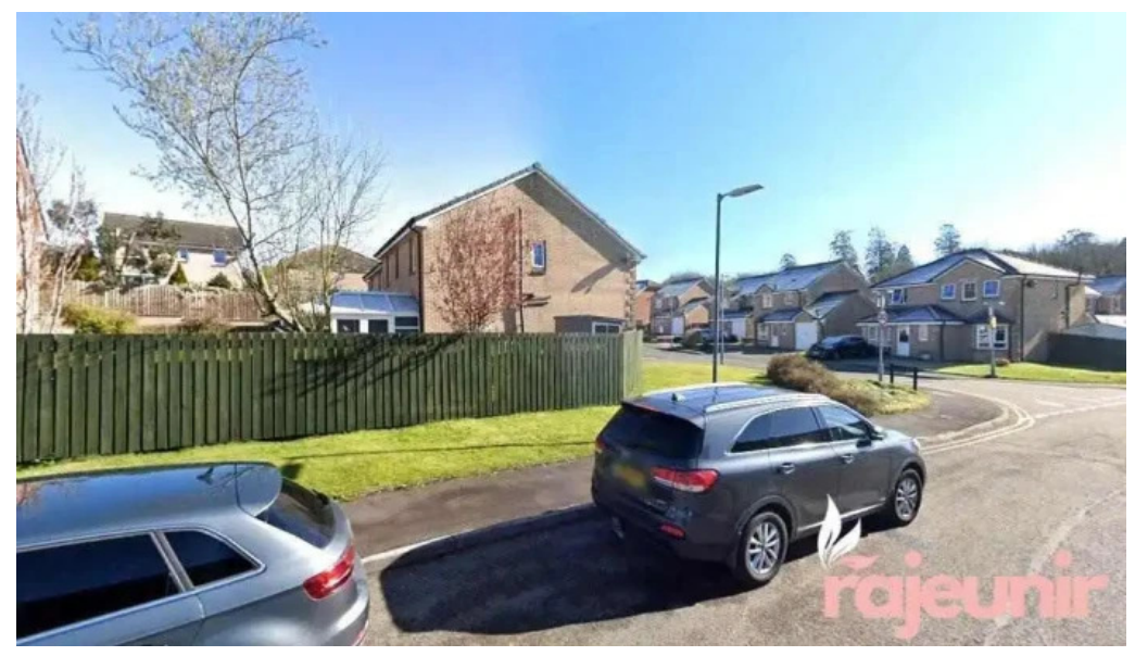
Boots pharmacy castle douglas