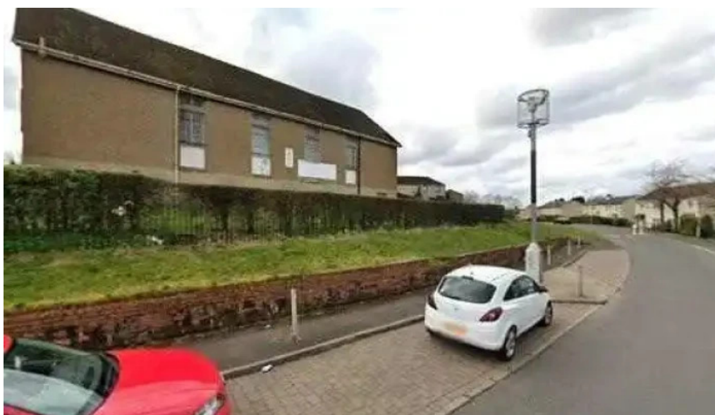
Townhead pharmacy all