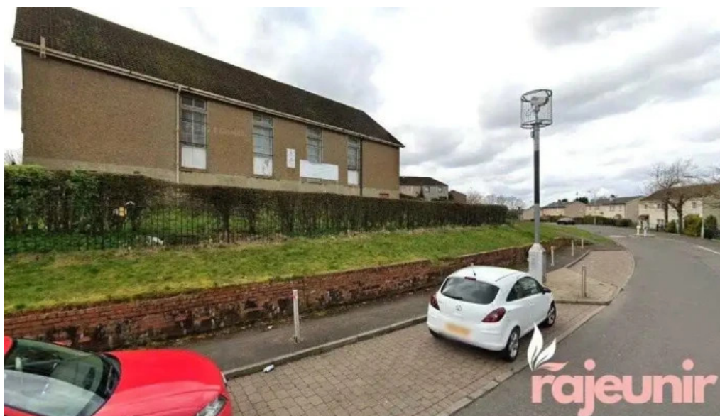
Townhead pharmacy coatbridge