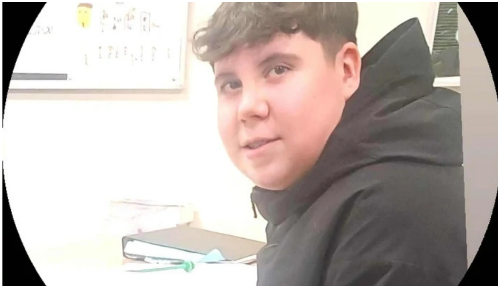
Townhead pharmacy pharmacy