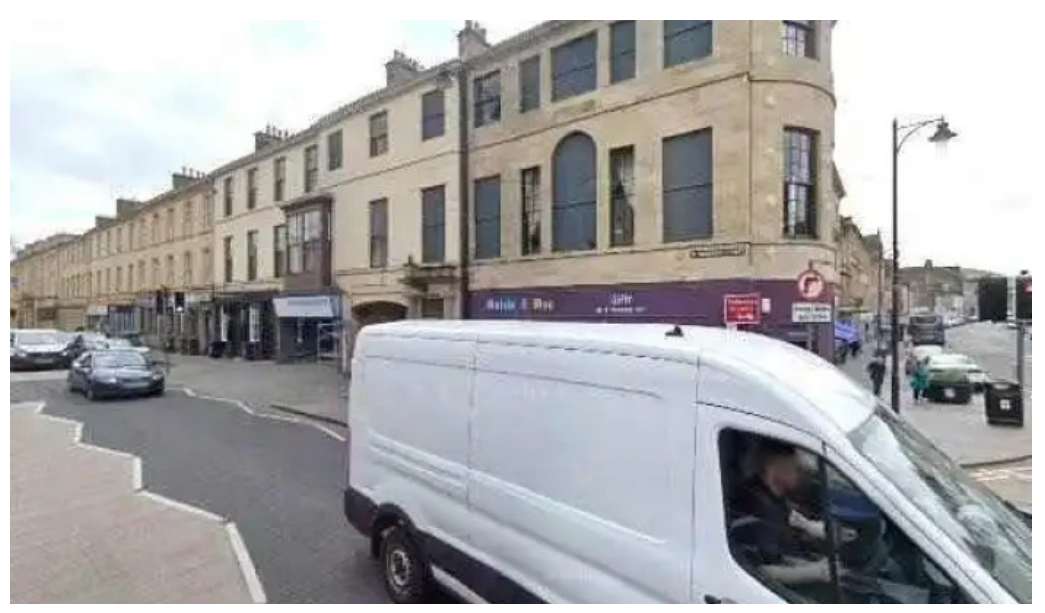
Boots pharmacy all