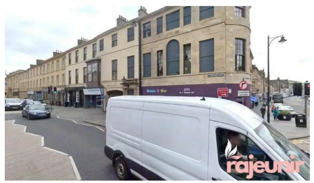
Boots pharmacy cupar