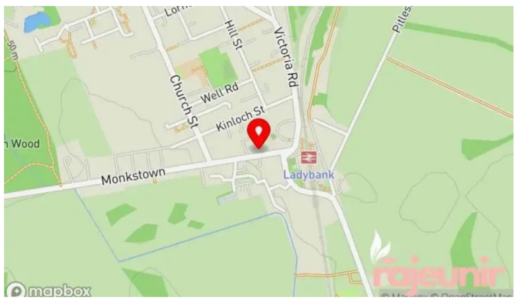
Davidsons chemists ladybank map