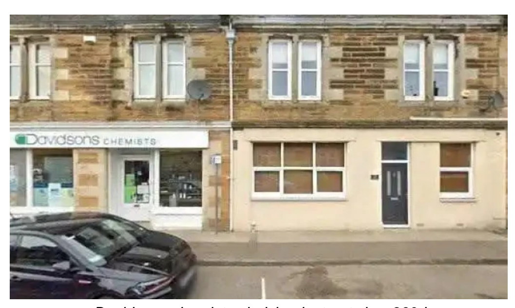
Davidsons chemists ladybank street view 360deg