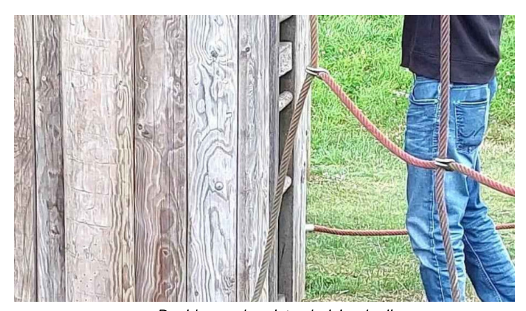
Davidsons chemists ladybank all