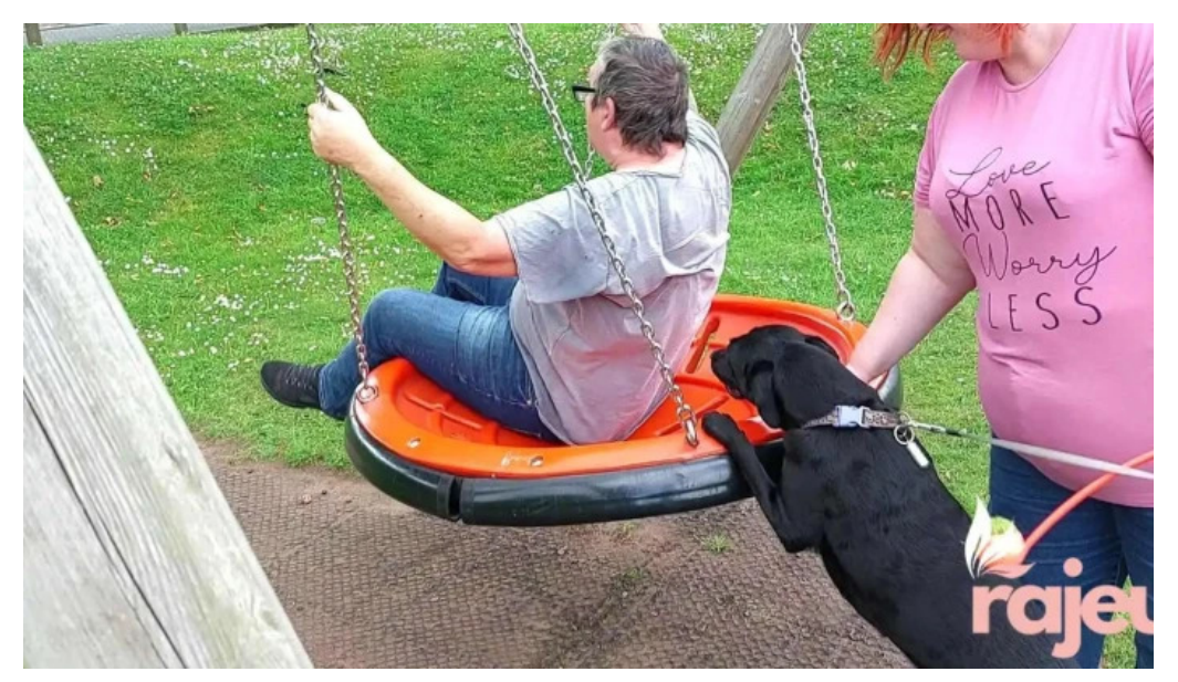
Davidsons chemists ladybank videos