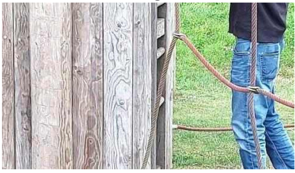
Davidsons chemists ladybank cupar