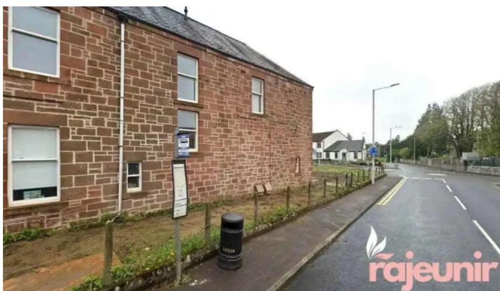
Lomond pharmacy cupar