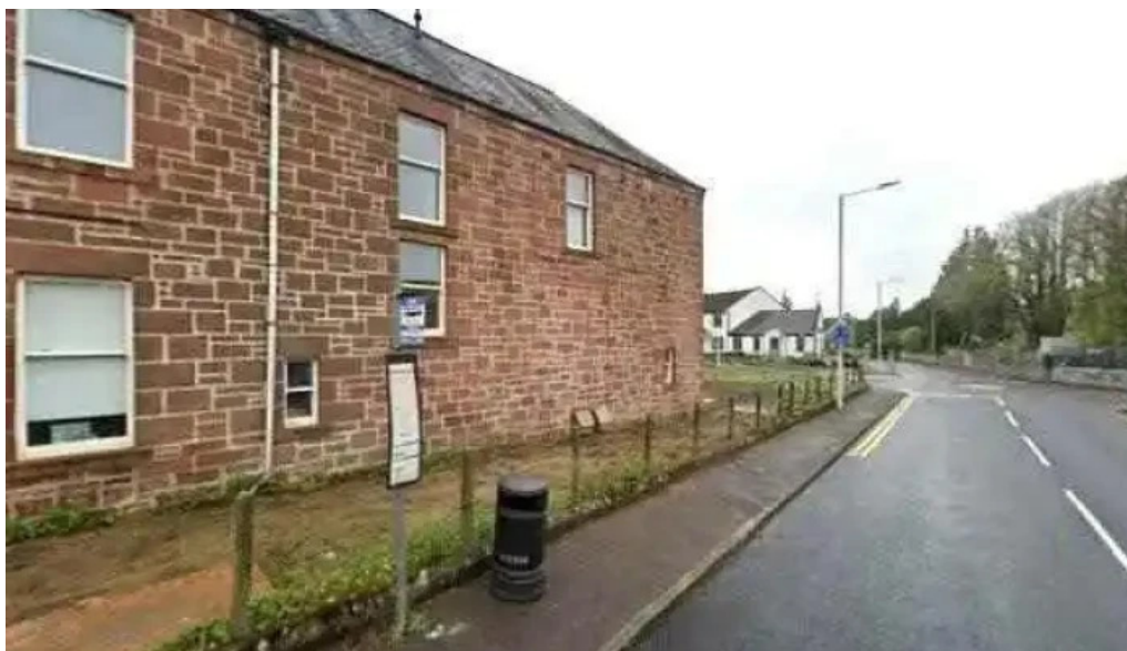
Lomond pharmacy all