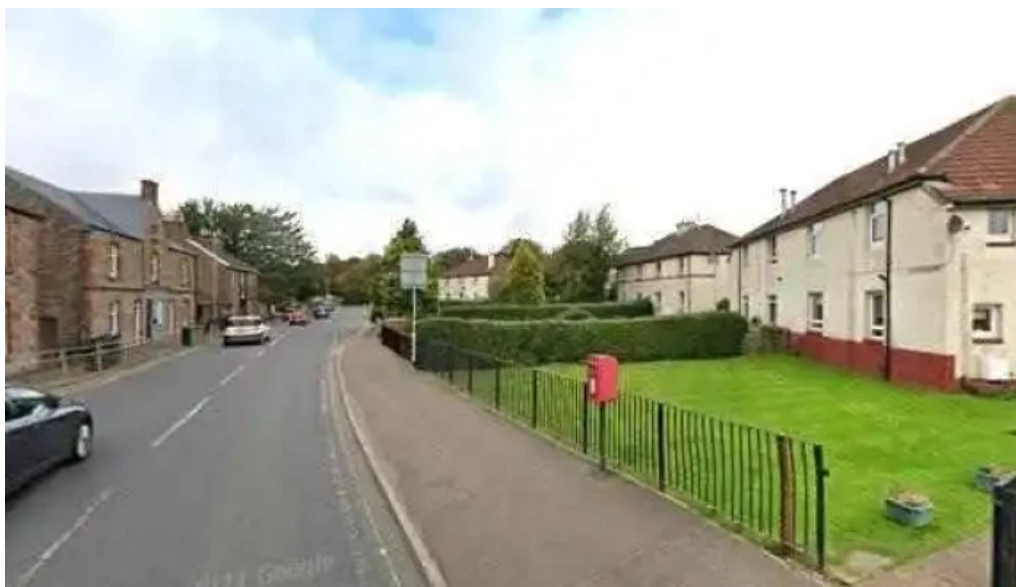
Cardross pharmacy street view 360deg