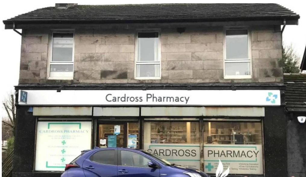
Cardross pharmacy all