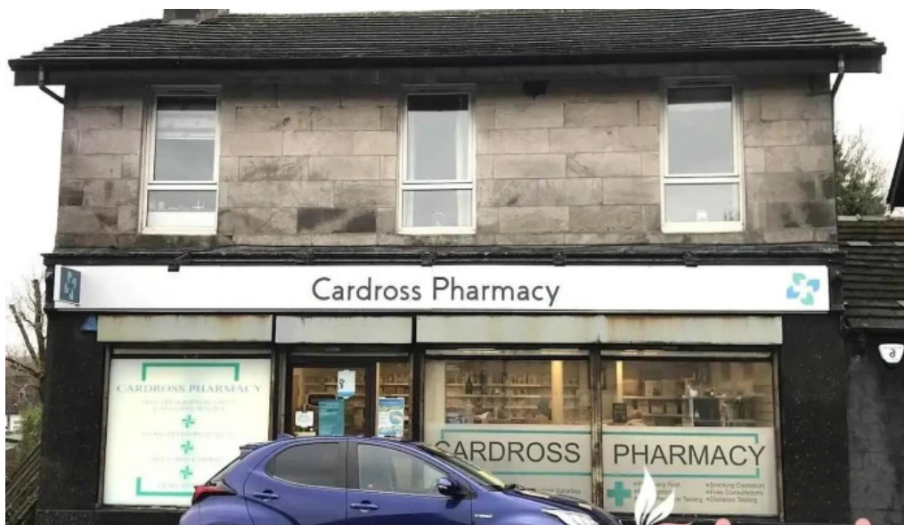
Cardross pharmacy dumbarton