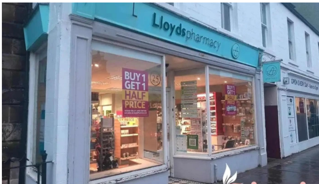
High street pharmacy dunbar