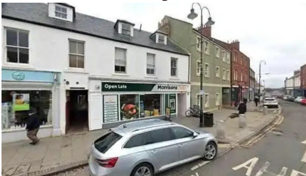
High street pharmacy street view 360deg