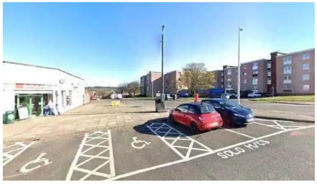
Davidsons chemists dundee menzieshill all