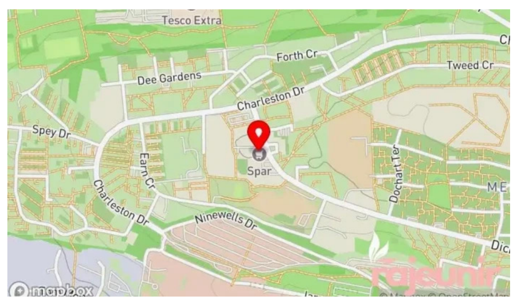
Davidsons chemists dundee menzieshill map