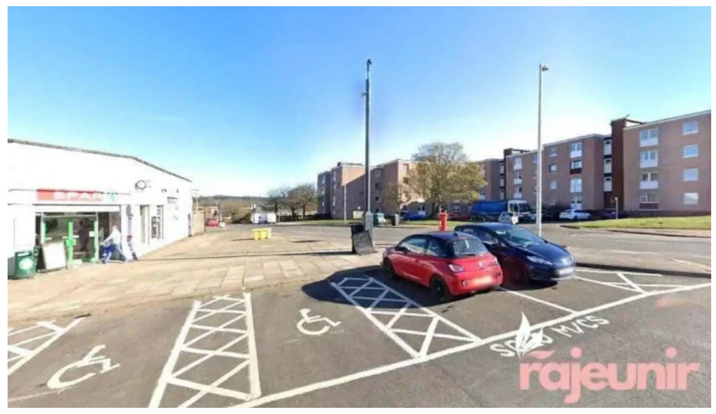
Davidsons chemists dundee menzieshill dundee