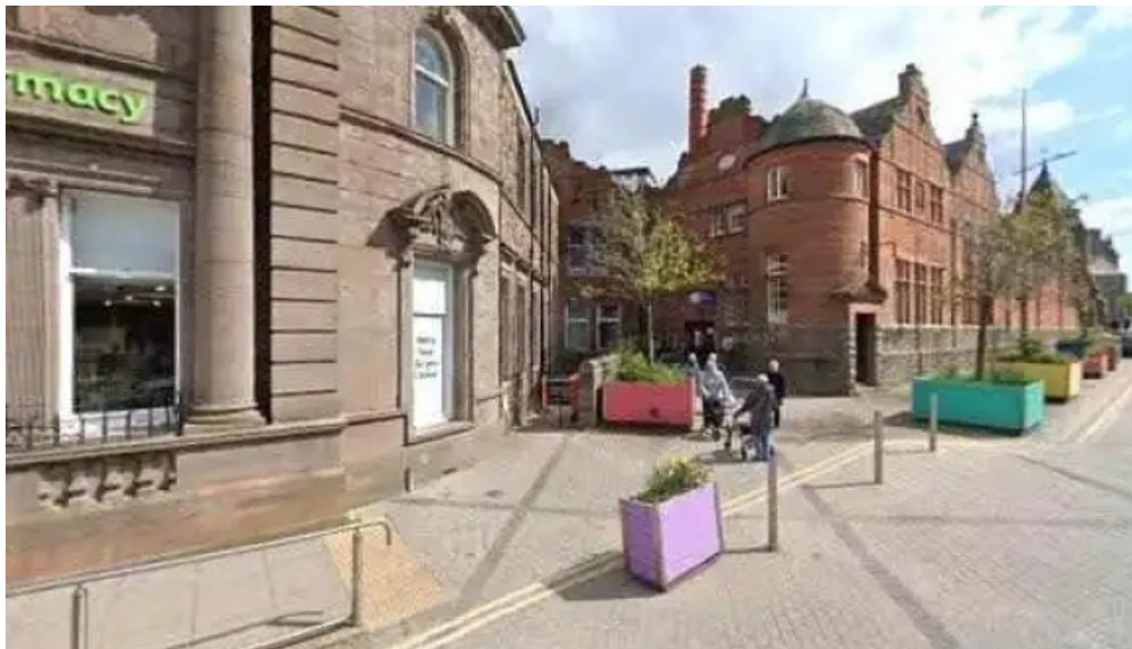
Davidsons pharmacy street view 360deg