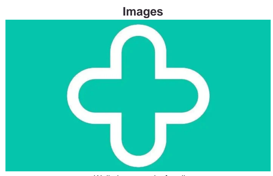
Well pharmacy dunfermline

If you wish to modify any data that you think is not correct about this portal, please forward a message so we can we will handle it at the earliest convenience. With anticipation we appreciate it.