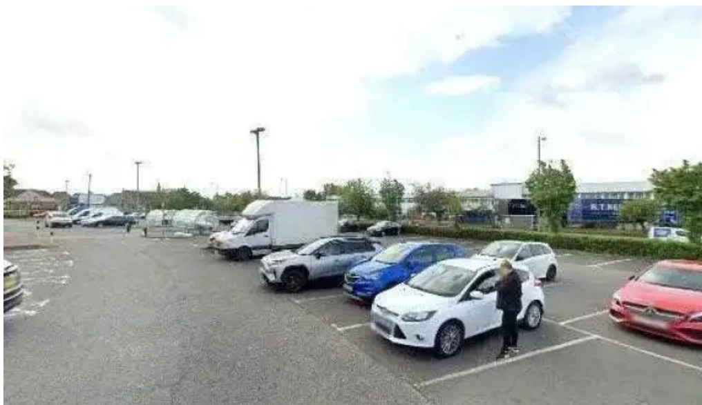
Boots pharmacy all