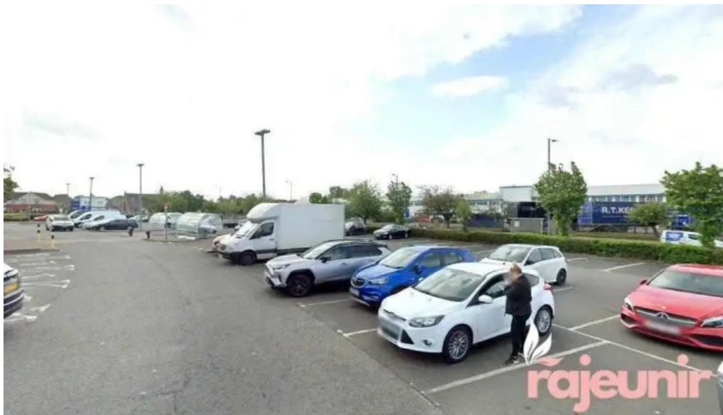
Boots pharmacy glasgow