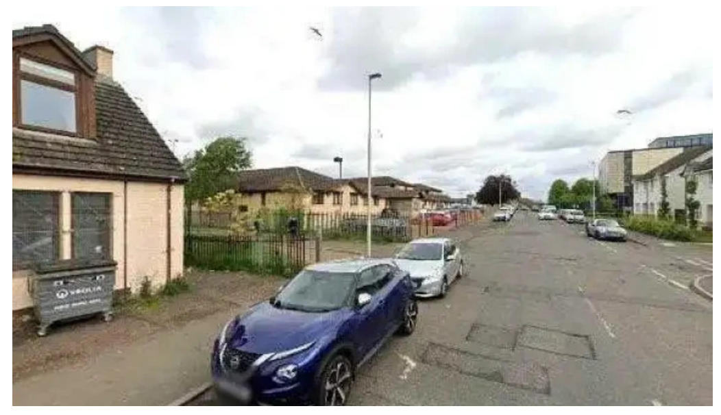
Boots pharmacy street view 360deg