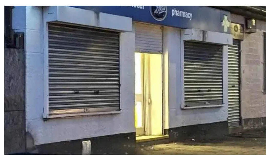
Boots pharmacy glasgow