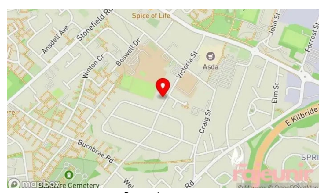
Boots pharmacy map