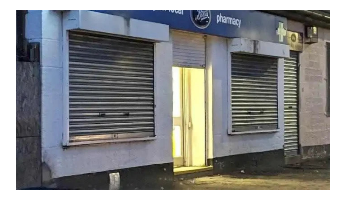
Pharmacy In Glasgow