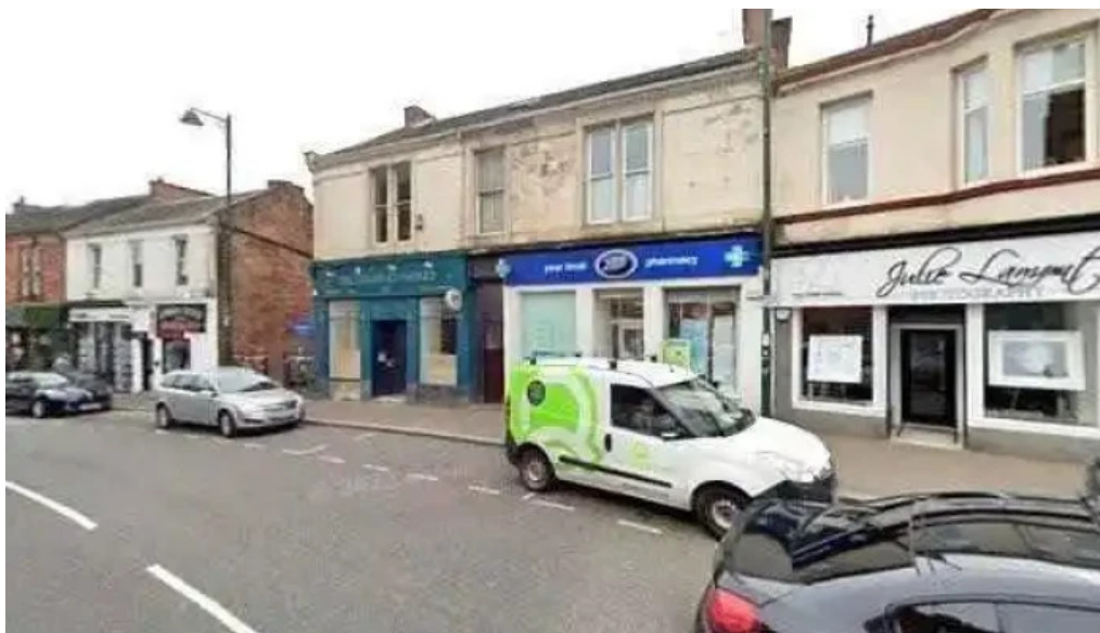
Boots pharmacy all