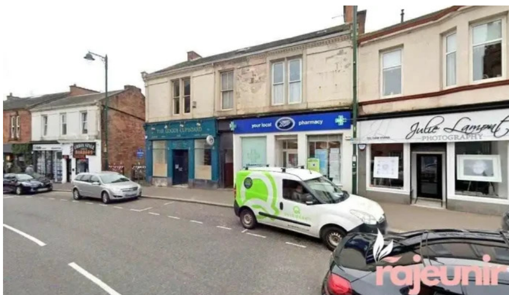
Boots pharmacy glasgow