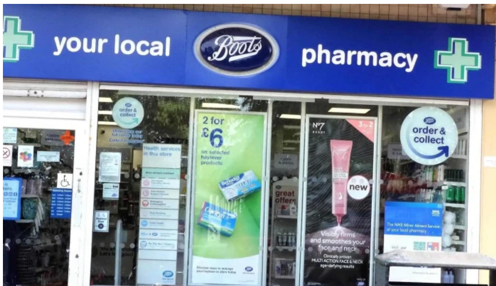
Boots pharmacy pharmacy