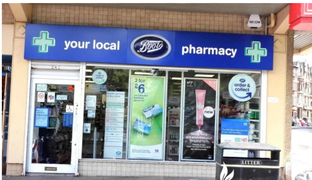
Boots pharmacy all