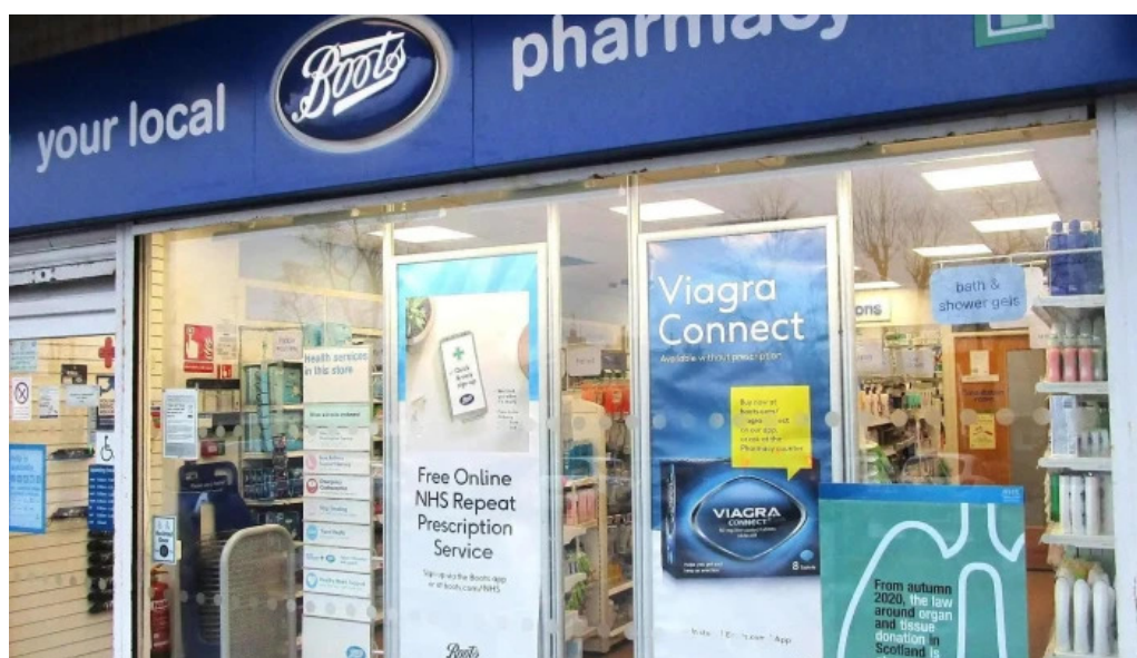
Boots pharmacy glasgow