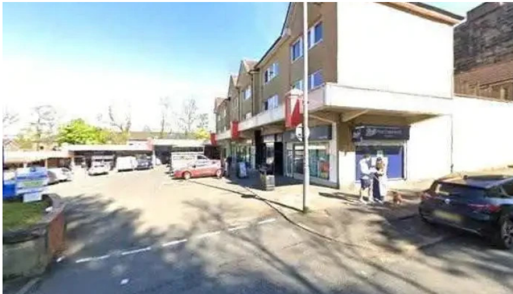
Boots pharmacy street view 360deg