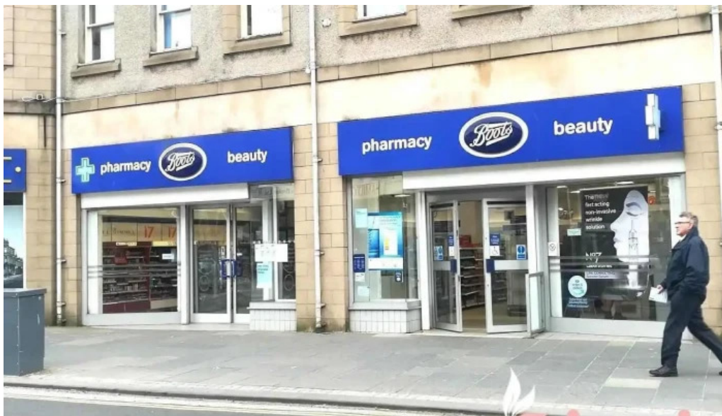
Boots pharmacy glasgow