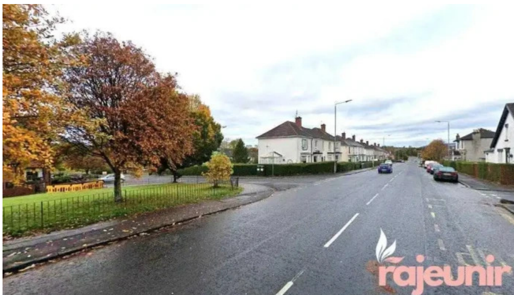
Boots pharmacy glasgow