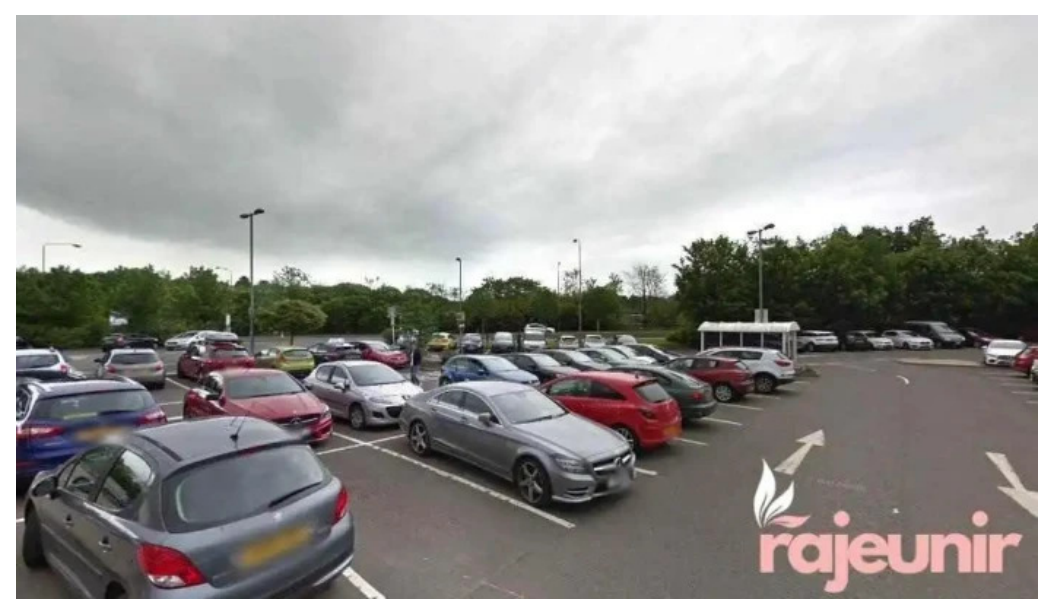
Boots pharmacy glasgow