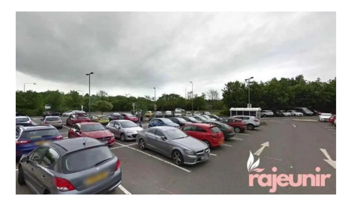
Pharmacy In Glasgow