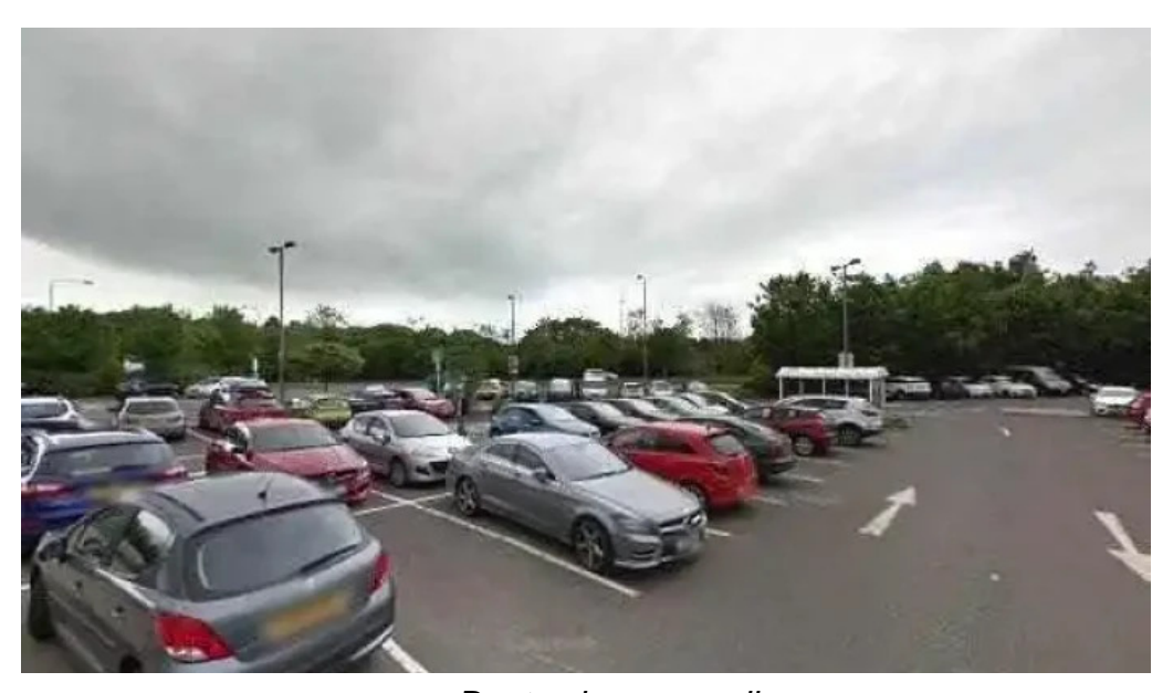
Boots pharmacy all