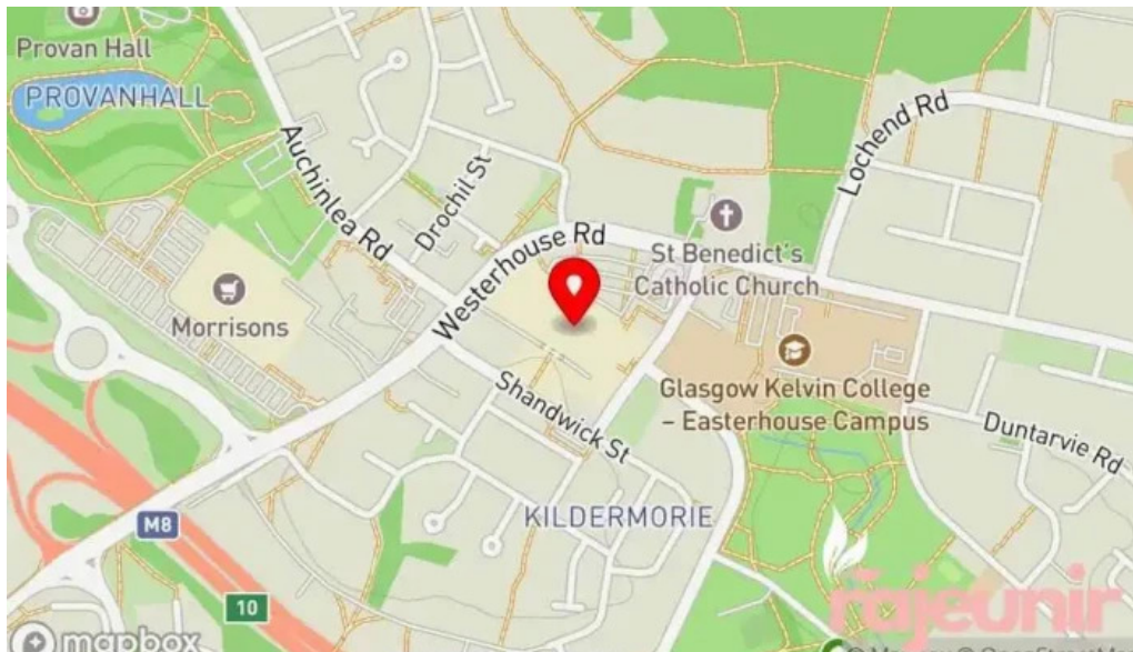
Easterhouse pharmacy map