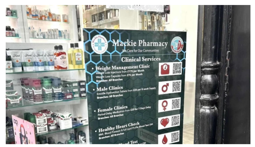
Mackie pharmacy area