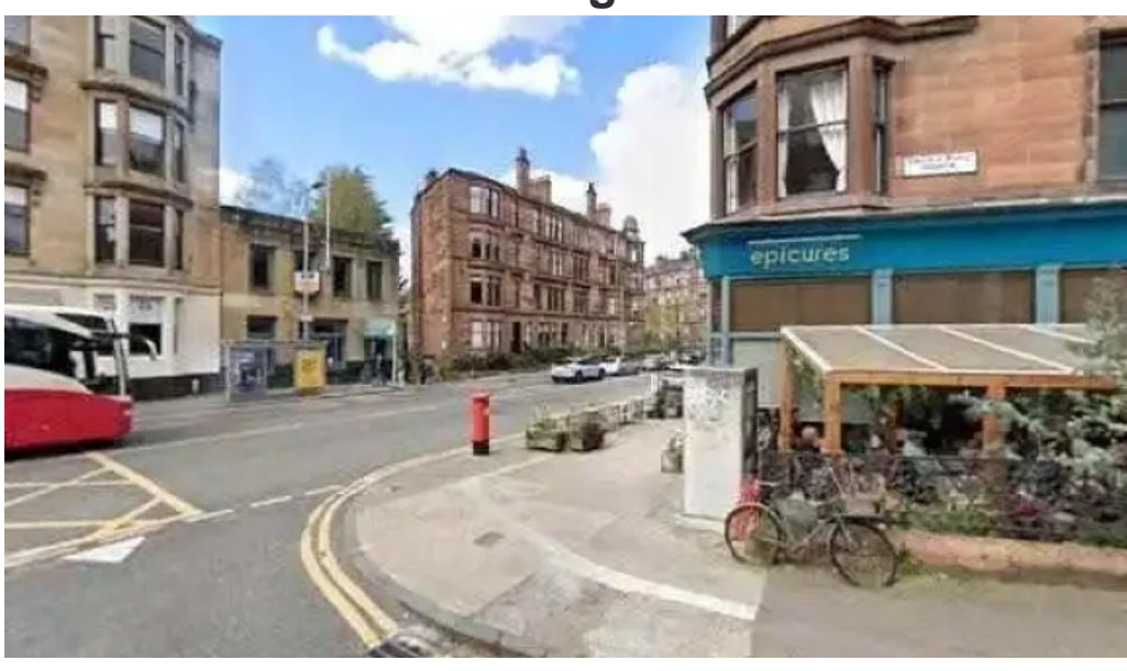
Mackie pharmacy street view 360deg