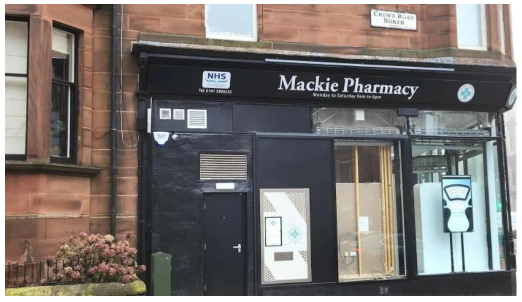
Mackie pharmacy pharmacy