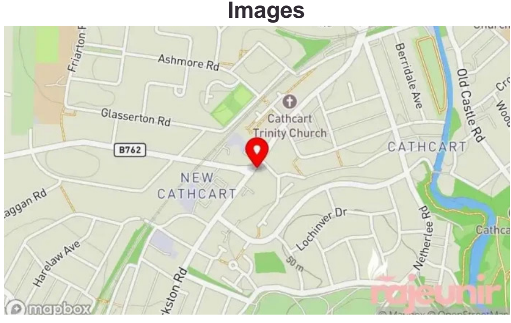
Merrylee pharmacy map

If you require to adjust any element that you consider is not correct regarding this site, please send a message and we will correct it quickly. In advance thanks for your cooperation.