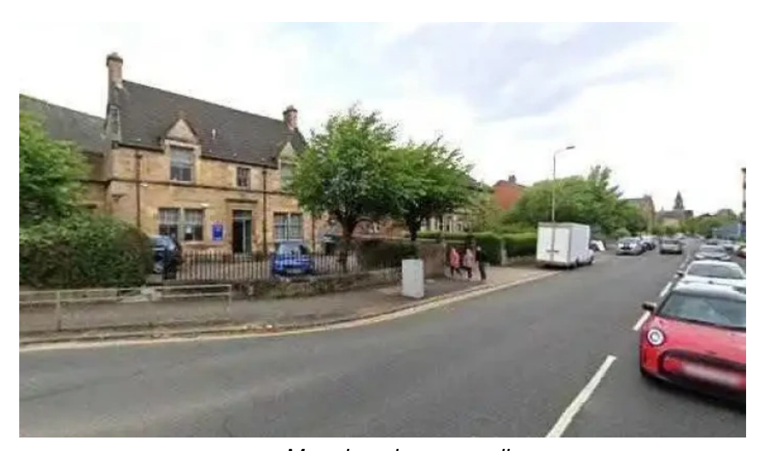
Merrylee pharmacy all