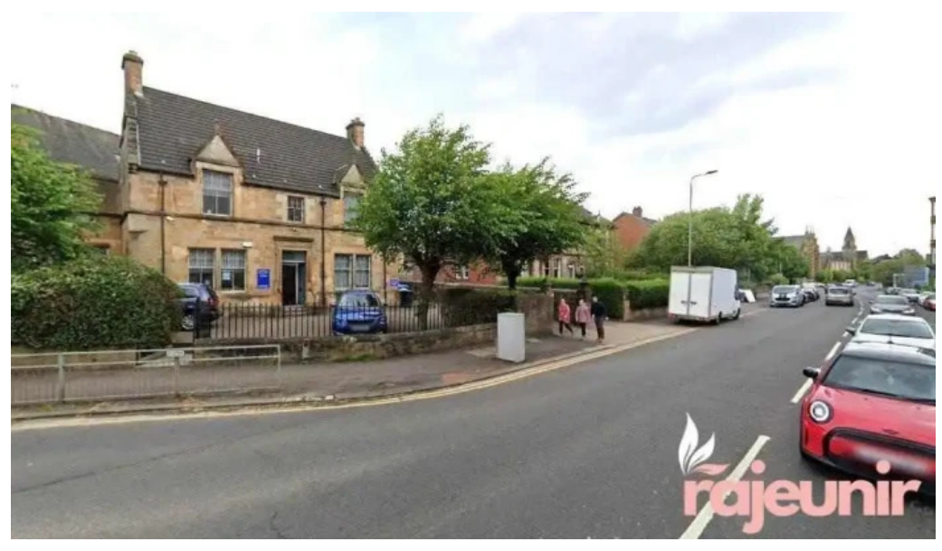
Merrylee pharmacy glasgow