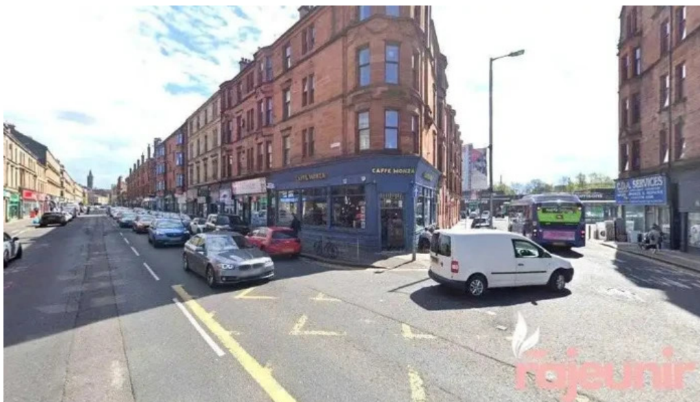
Sinclair pharmacy glasgow