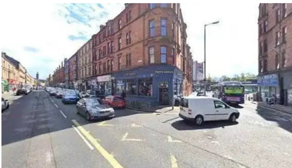
Sinclair pharmacy all