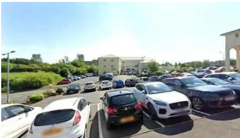
St james pharmacy street view 360deg