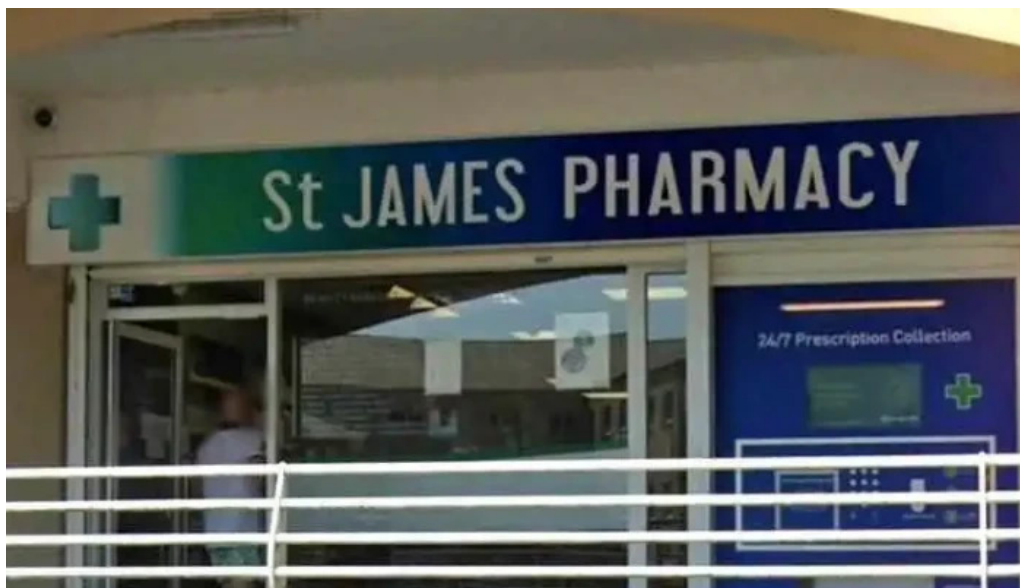
St james pharmacy glasgow