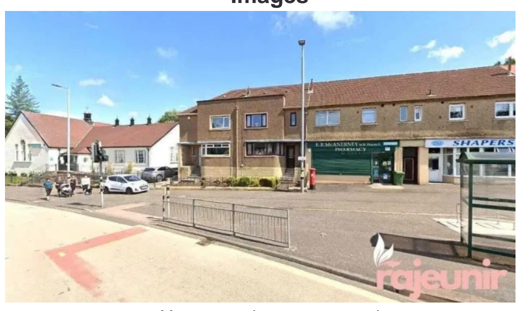
Mcanerney pharmacy greenock