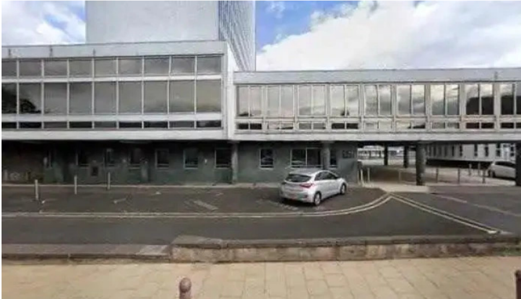
Boots pharmacy street view 360deg