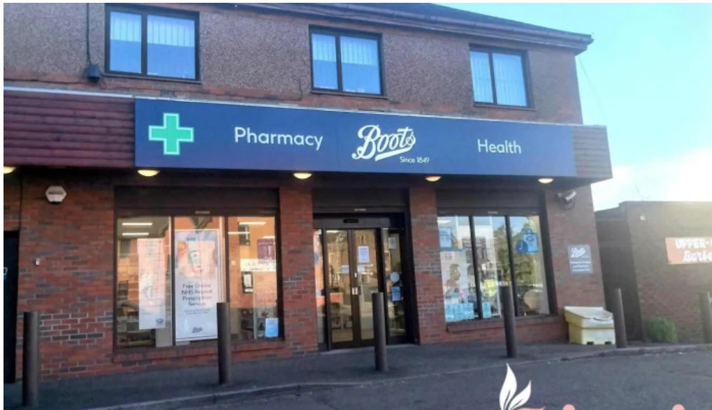
Boots pharmacy all