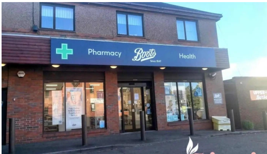
Boots pharmacy hamilton