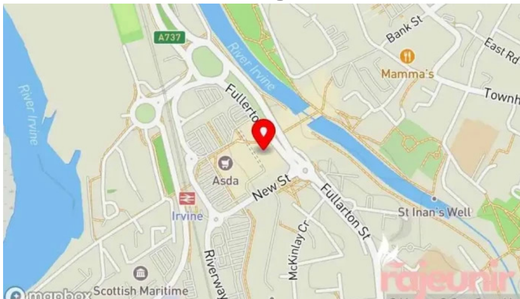
Boots pharmacy map