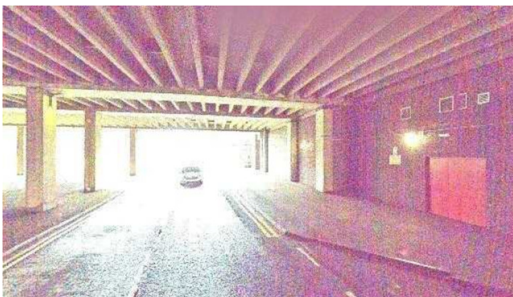
Boots pharmacy all