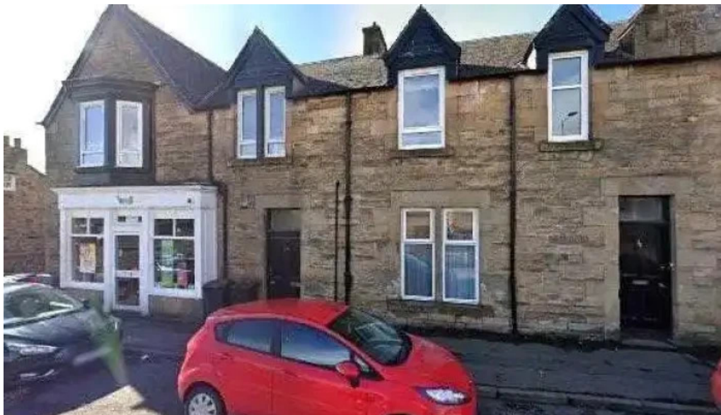
Well pharmacy street view 360deg