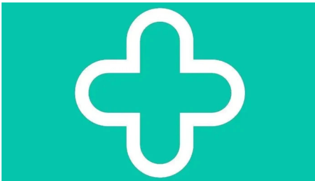
Well pharmacy kirkliston