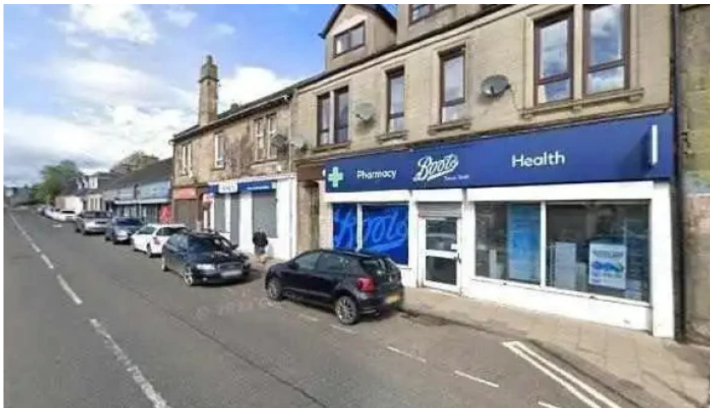
Boots pharmacy all