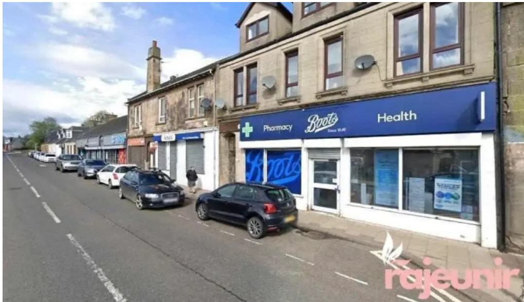
Boots pharmacy larkhall