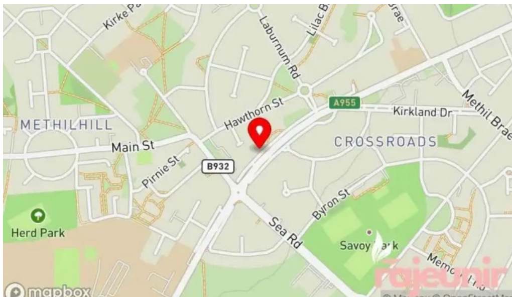
Omnicare pharmacy methil map