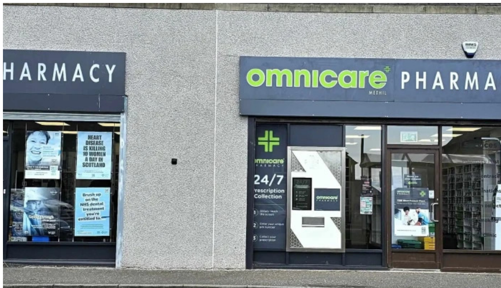
Omnicare pharmacy methil pharmacy