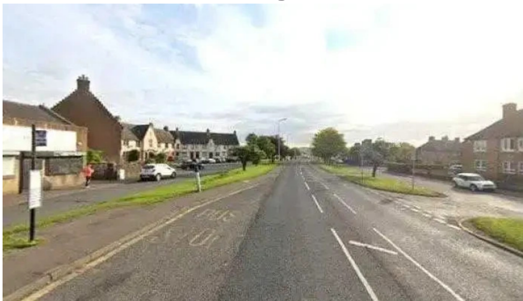
Omnicare pharmacy methil street view 360deg