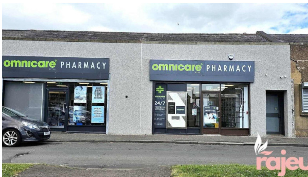
Omnicare pharmacy methil leven