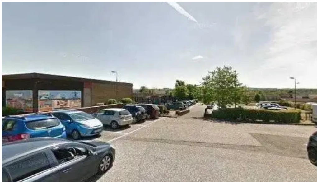
Boots pharmacy street view 360deg