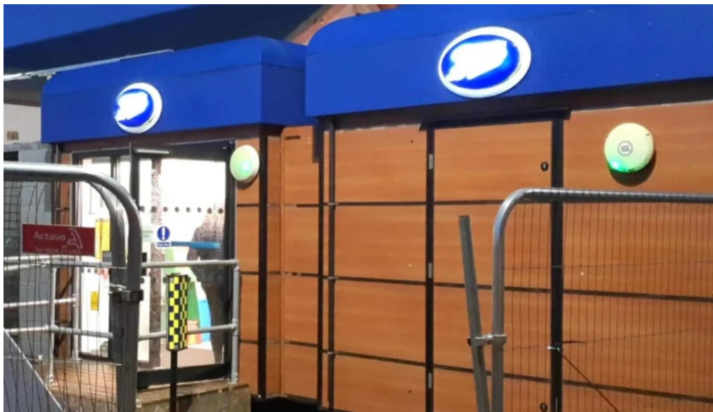
Boots pharmacy pharmacy