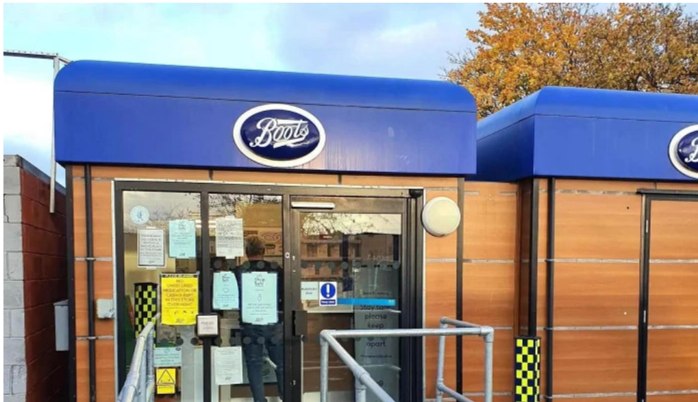
Boots pharmacy score