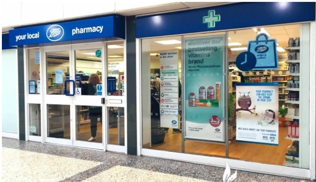
Boots pharmacy all