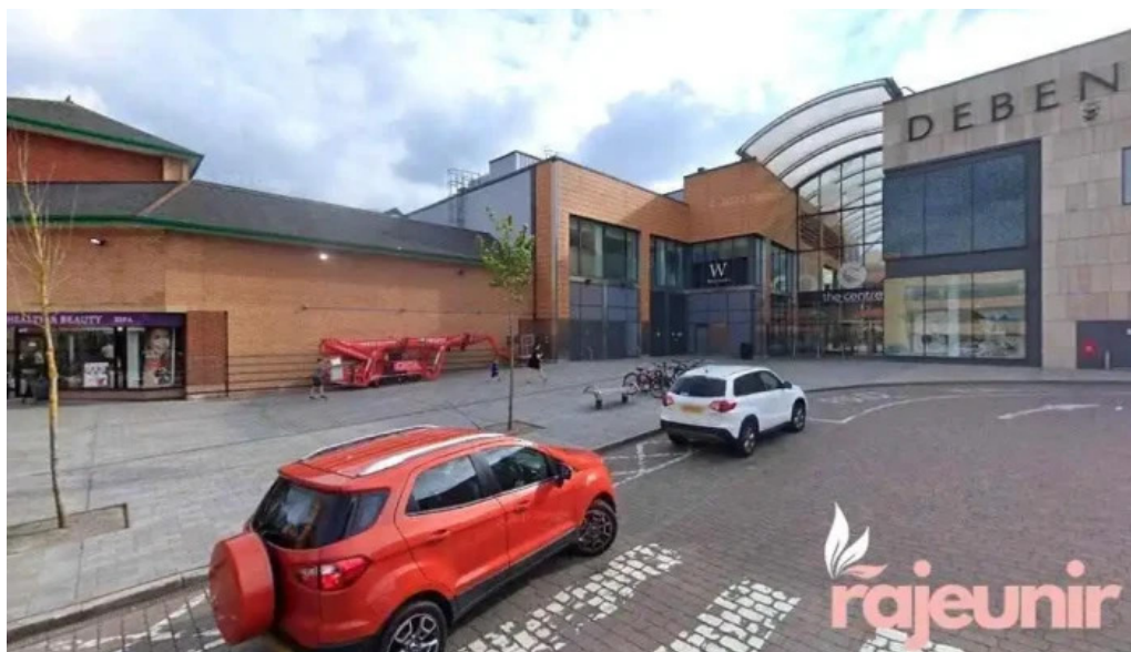
Boots pharmacy livingston