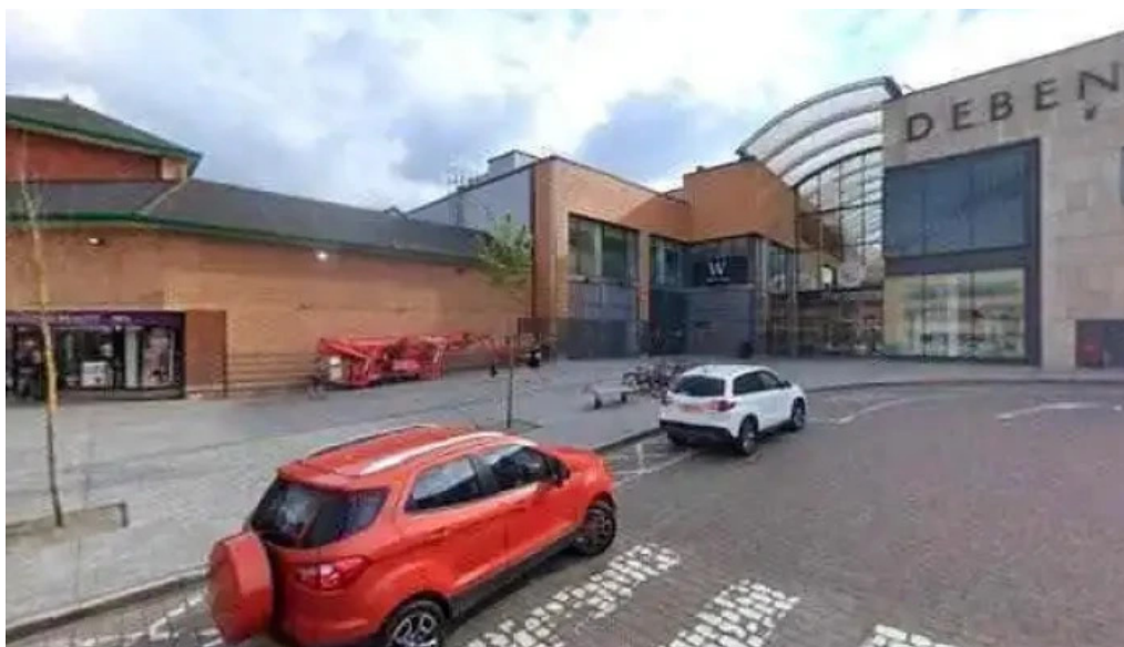
Boots pharmacy all