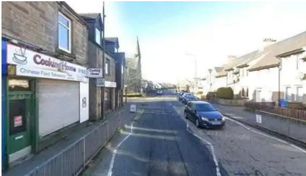
Lindsay gilmour pharmacy east calder street view 360deg