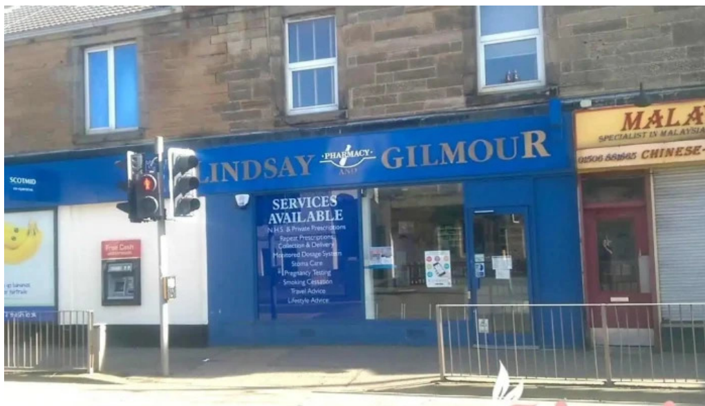
Lindsay gilmour pharmacy east calder livingston