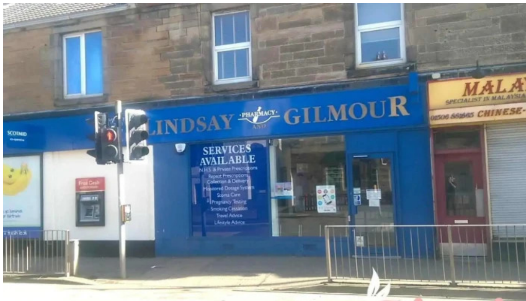
Lindsay gilmour pharmacy east calder all