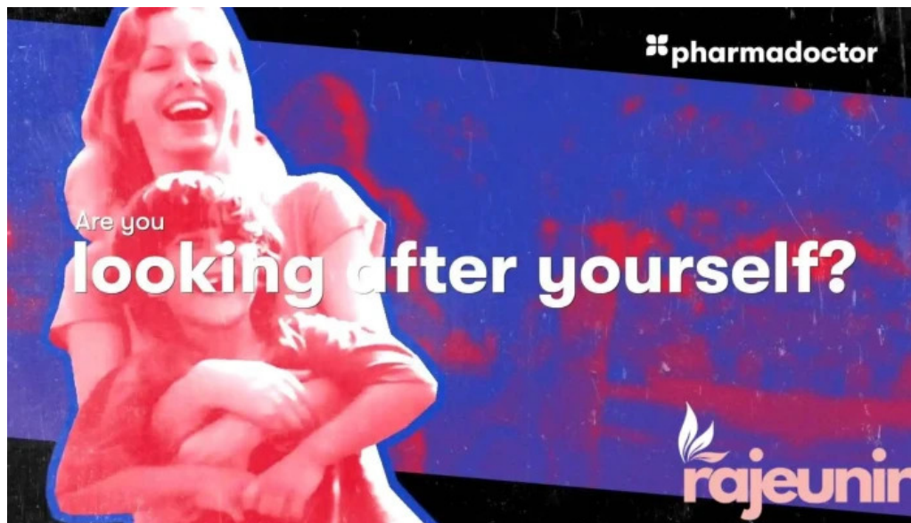
Lindsay gilmour pharmacy east calder by owner