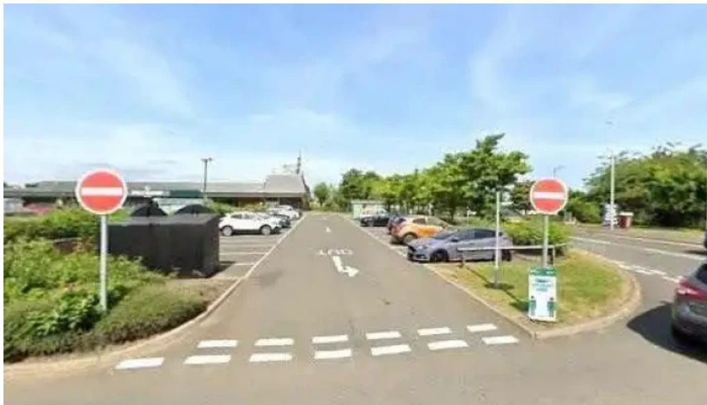
Morrisons pharmacy street view 360deg