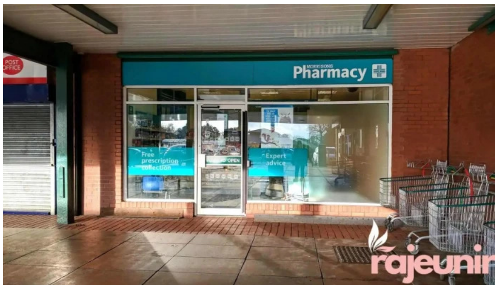
Morrisons pharmacy livingston