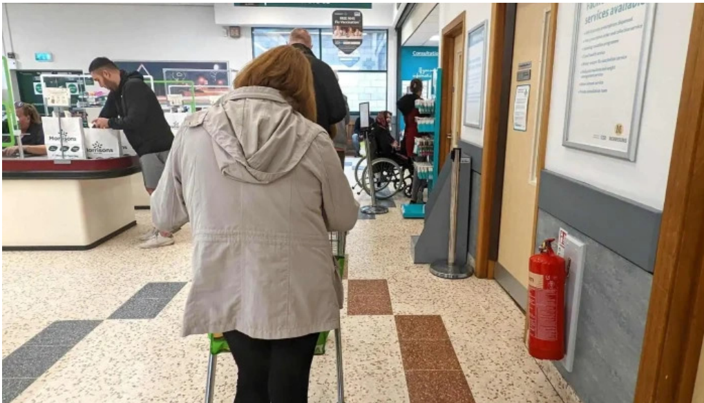
Morrisons pharmacy pharmacy