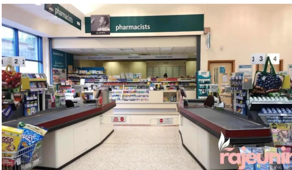
Morrisons pharmacy livingston