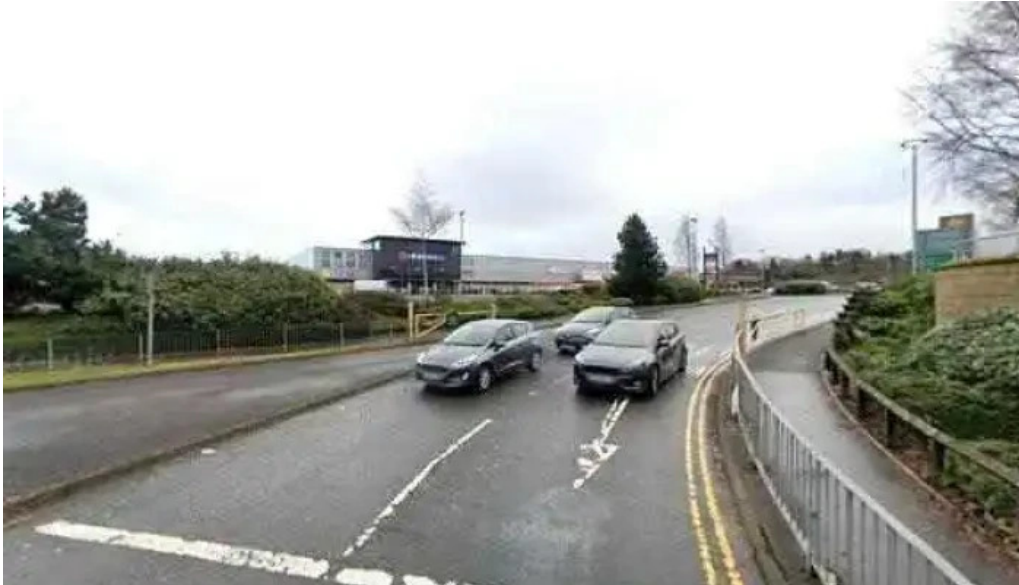
Morrisons pharmacy street view 360deg