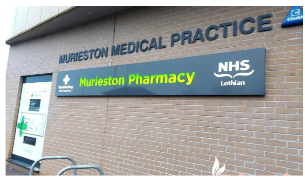
Murieston pharmacy by owner