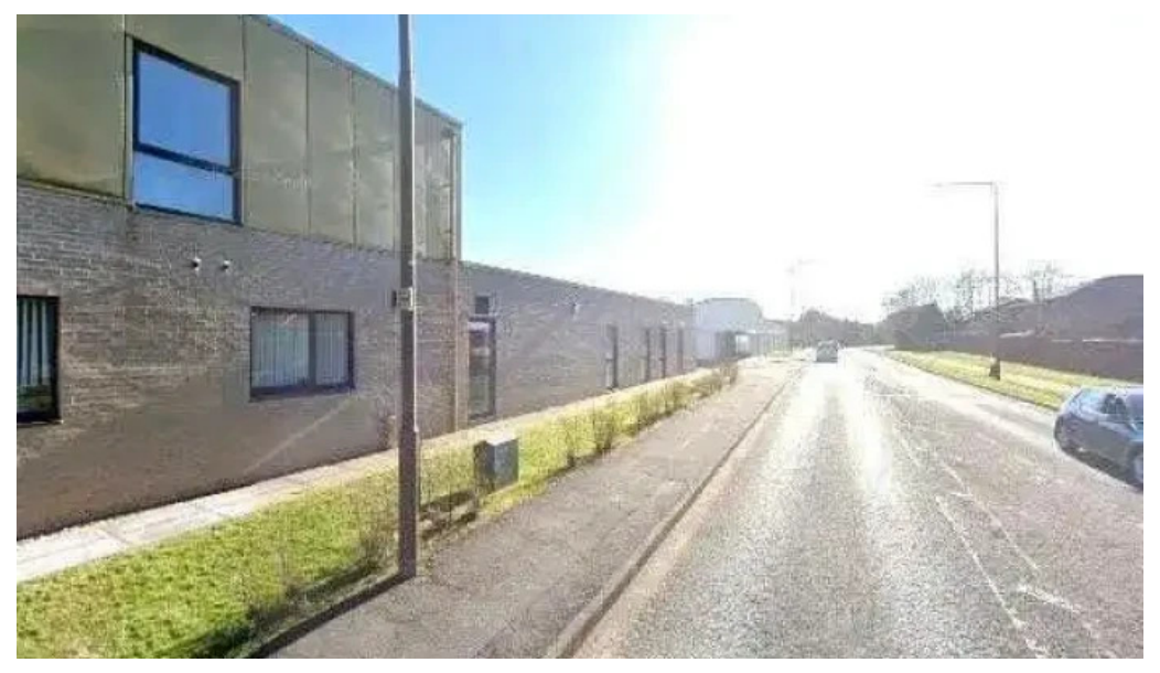
Murieston pharmacy street view 360deg