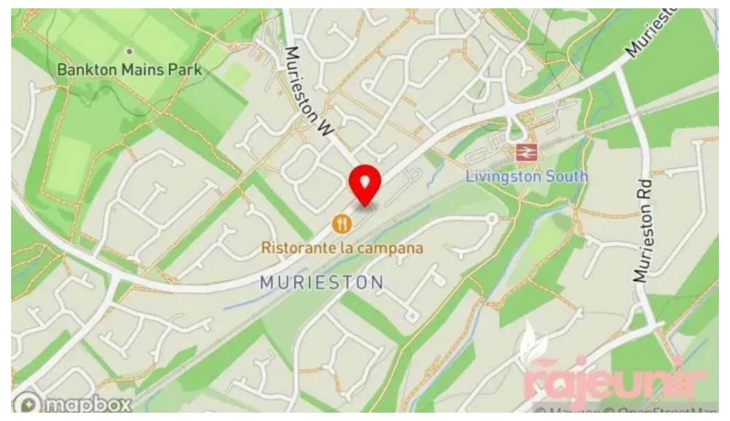
Murieston pharmacy map