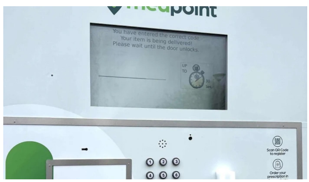
Murieston pharmacy pharmacy