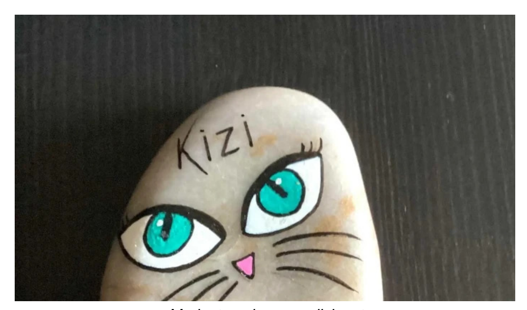
Murieston pharmacy livingston