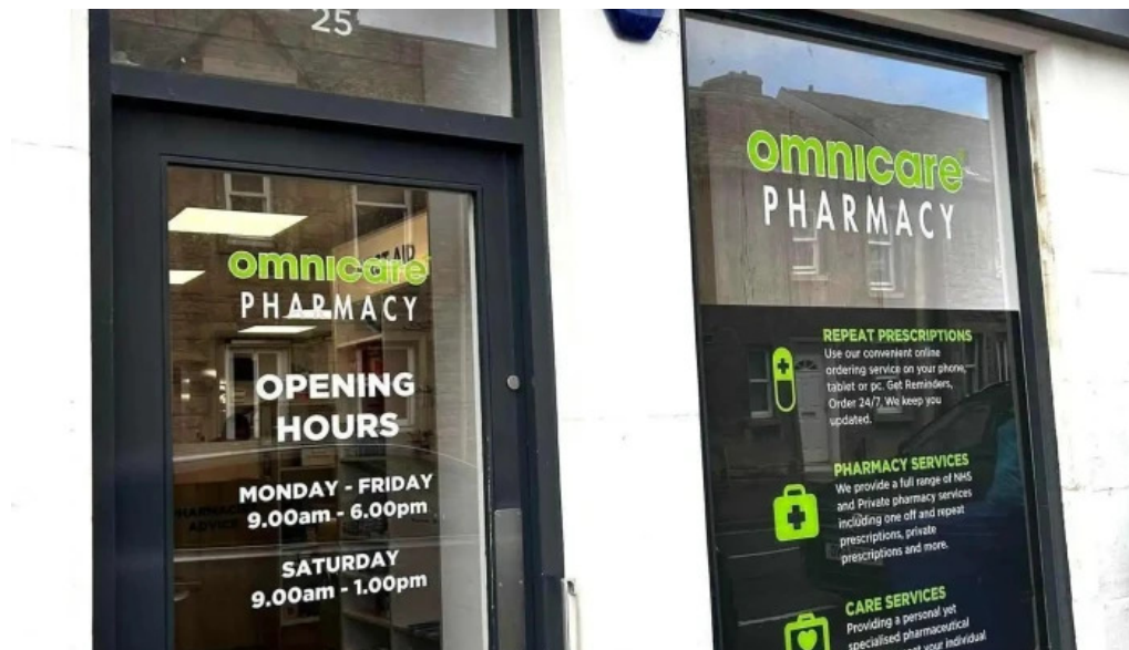
Omnicare pharmacy mid calder travel clinic by owner