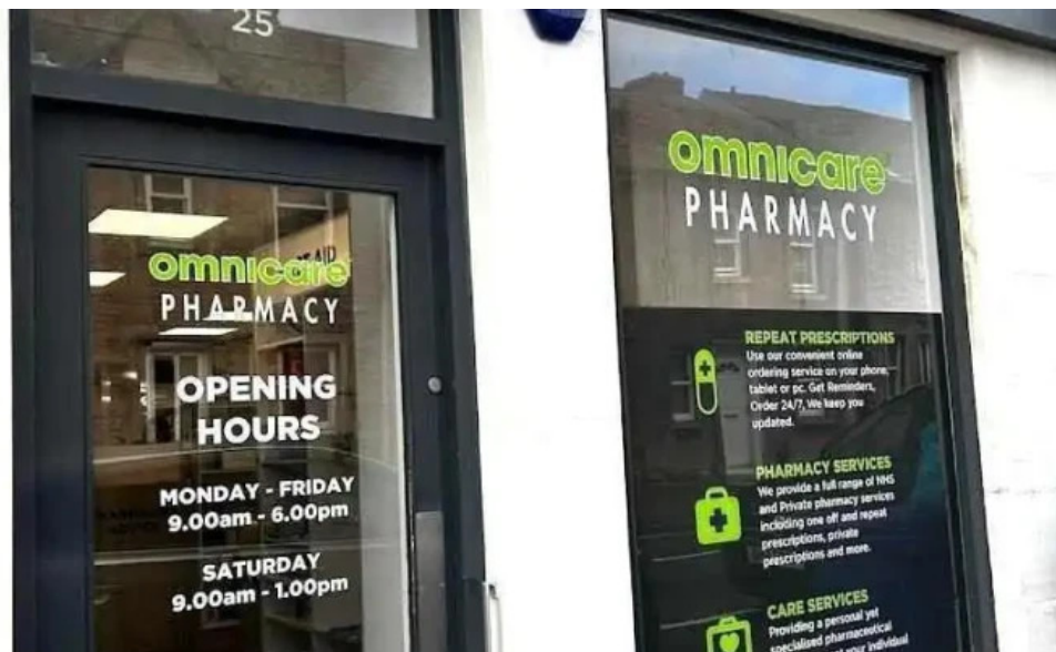
Omnicare pharmacy mid calder travel clinic livingston