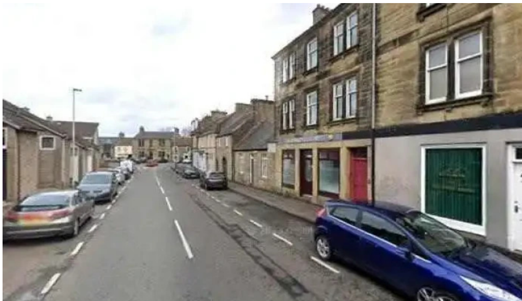
Omnicare pharmacy mid calder travel clinic street view 360deg