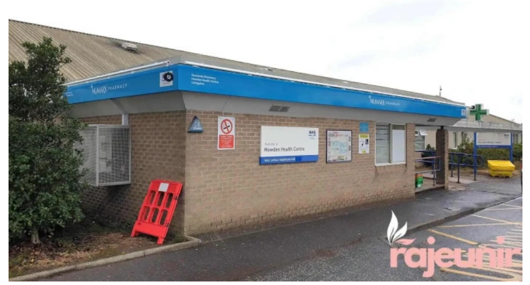
Rowlands pharmacy howden health centre livingston