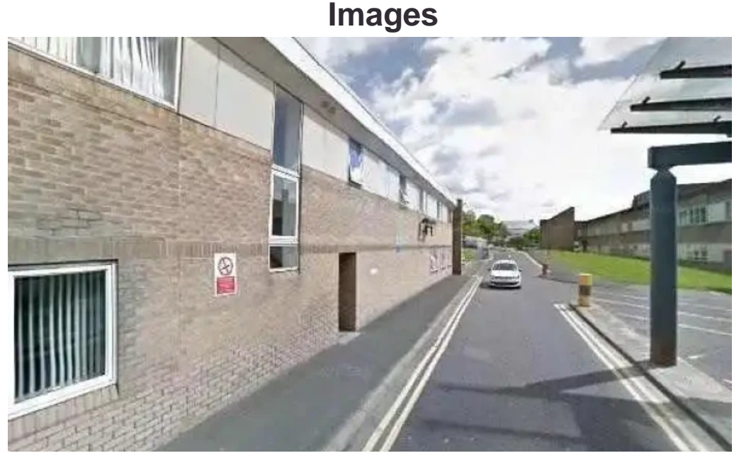
Rowlands pharmacy howden health centre street view 360deg

In case you want to adjust any information that you consider is not correct related to this web, please send a message so that we will fix it as soon as possible. In advance thanks.