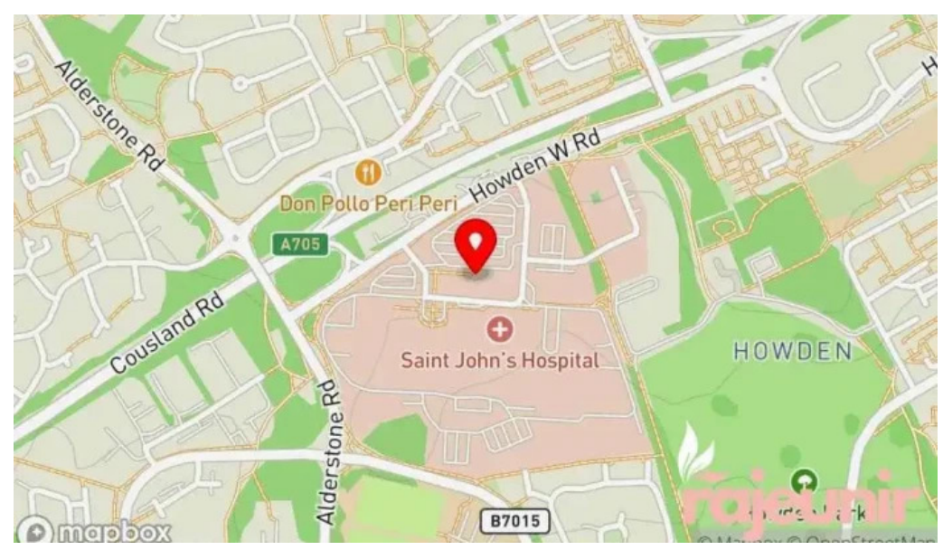
Rowlands pharmacy howden health centre map