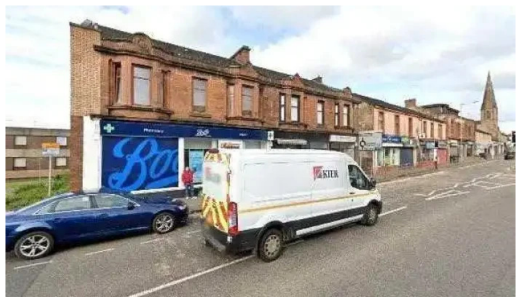
Boots pharmacy all