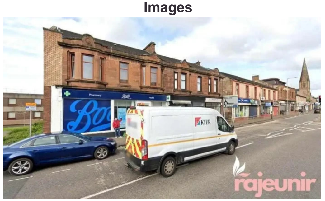
Boots pharmacy motherwell

If you wish to change any data that you feel is not precise about this web, we kindly request deliver a message and we will handle it promptly. Thanks beforehand thanks for your cooperation.