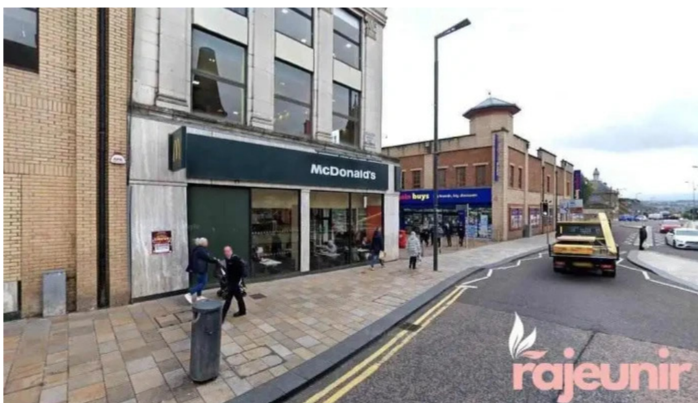
Boots pharmacy motherwell