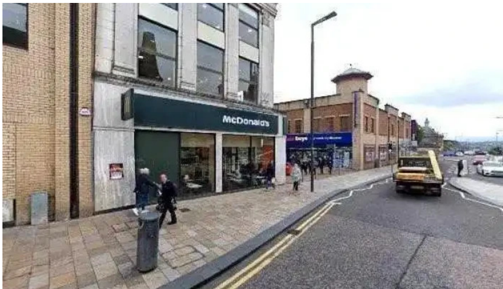
Boots pharmacy all