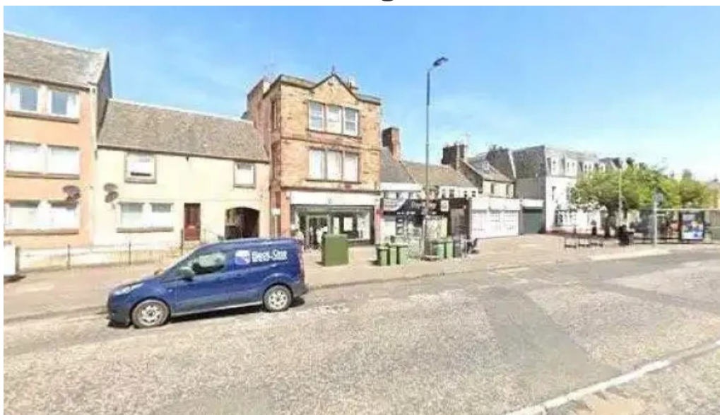
Well pharmacy street view 360deg