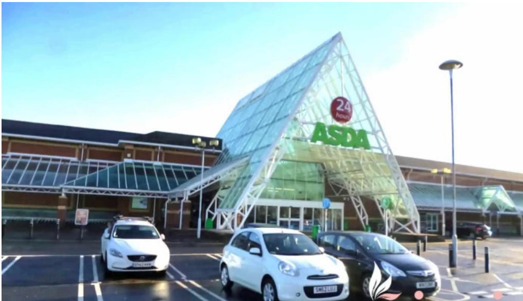
Asda pharmacy all