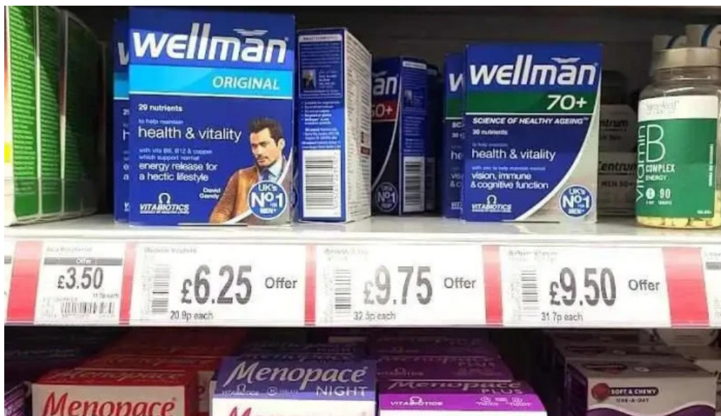
Asda pharmacy perth