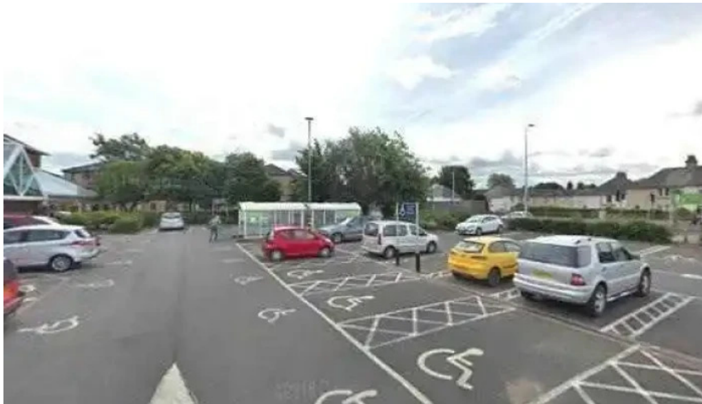
Asda pharmacy street view 360deg