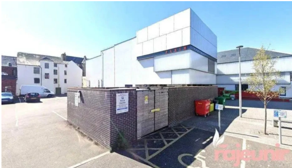
Boots pharmacy perth