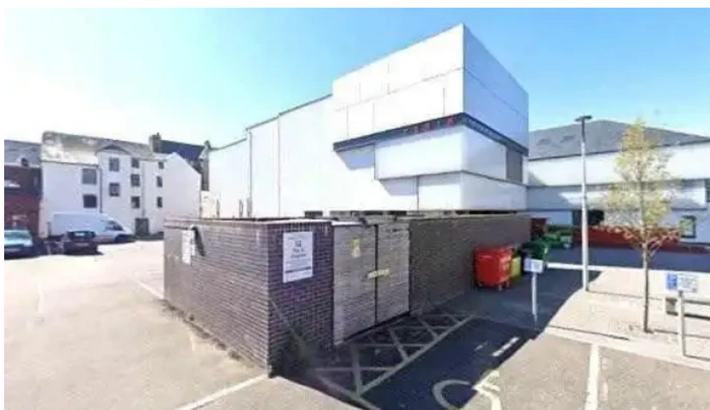
Boots pharmacy all