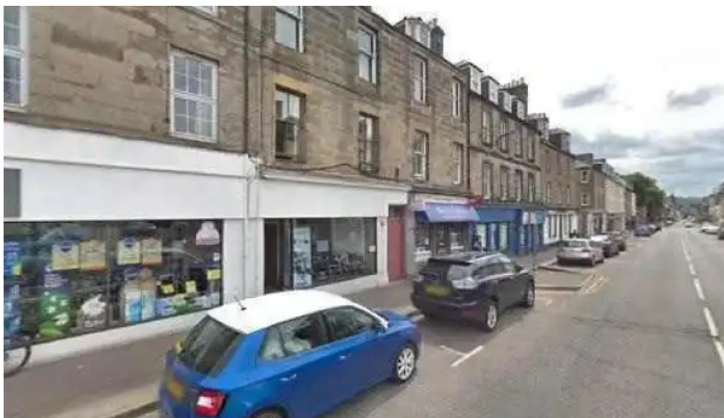
Browns pharmacy healthcare street view 360deg