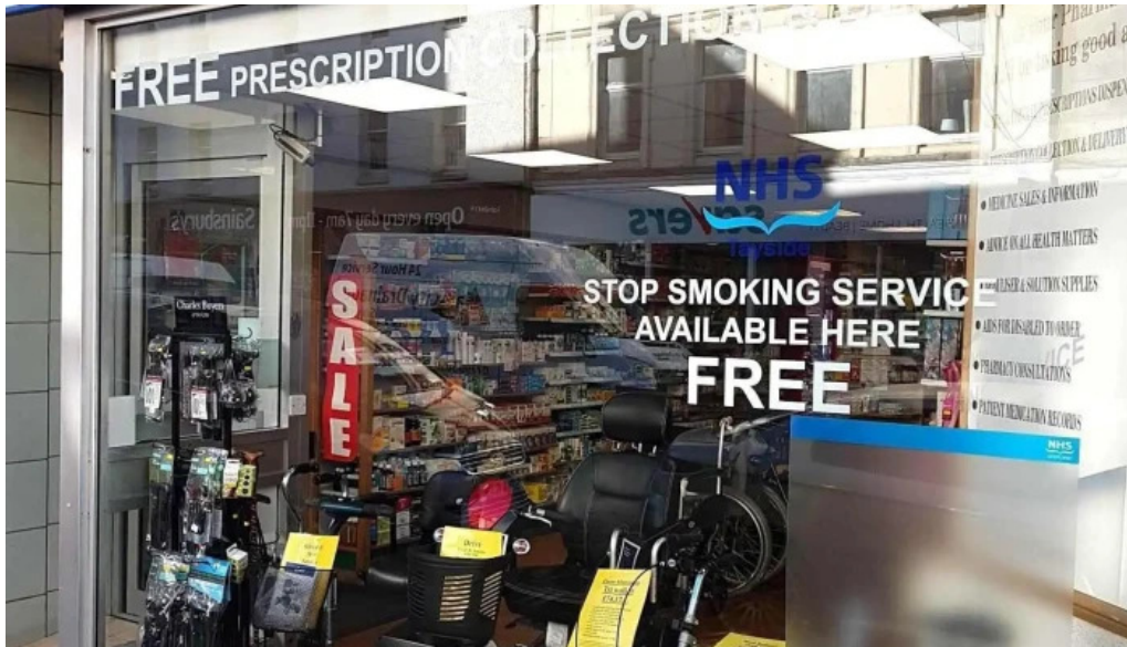
Browns pharmacy healthcare all