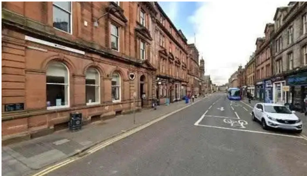
Browns pharmacy healthcare street view 360deg