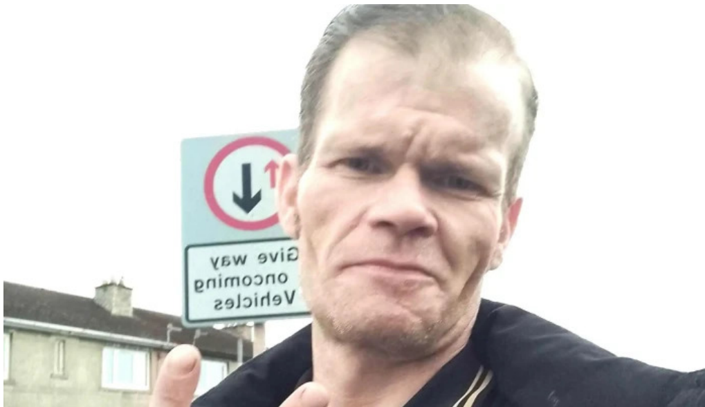
Browns pharmacy healthcare pharmacy