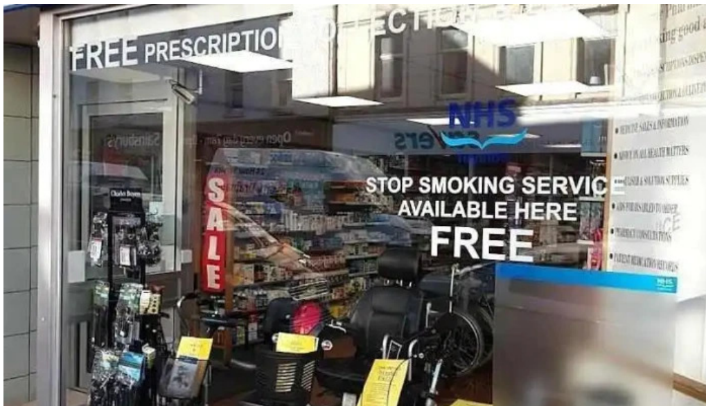
Browns pharmacy healthcare perth